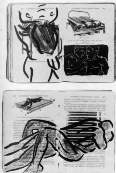
Above: Andy Fabo Superheater 1988 Pages 153-153A and 180-181 Multimedia bookwork