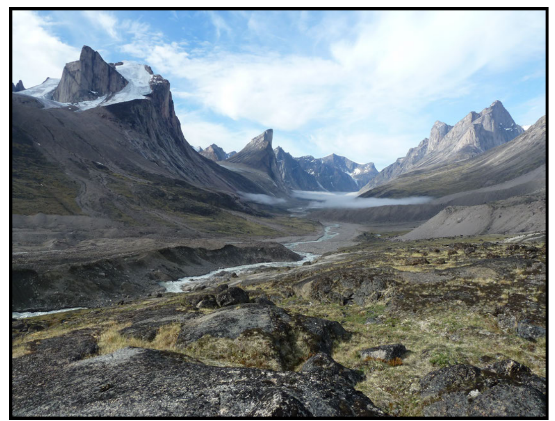
Akshayuk Pass, Auyuittak National Park, Baffin Island