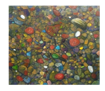
Poetry Basma Kavanagh