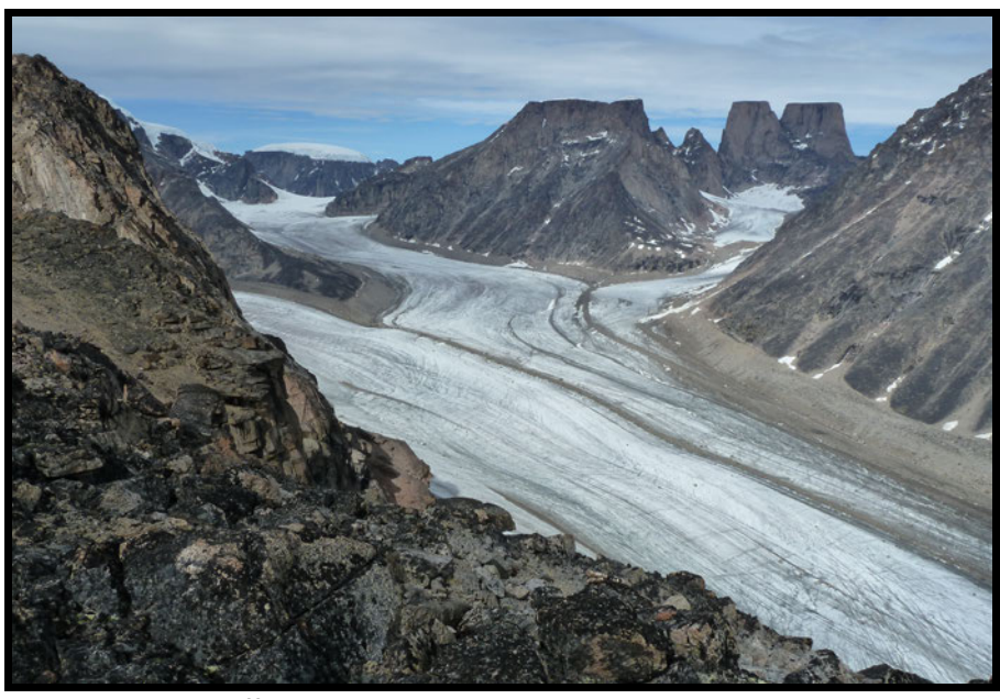
Mount Asgaard, Baffin Island