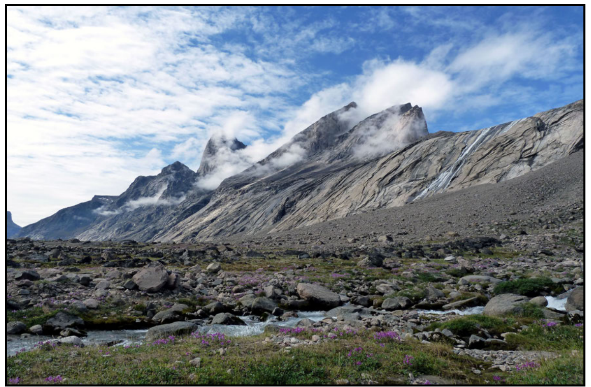
Auyuittak National Park