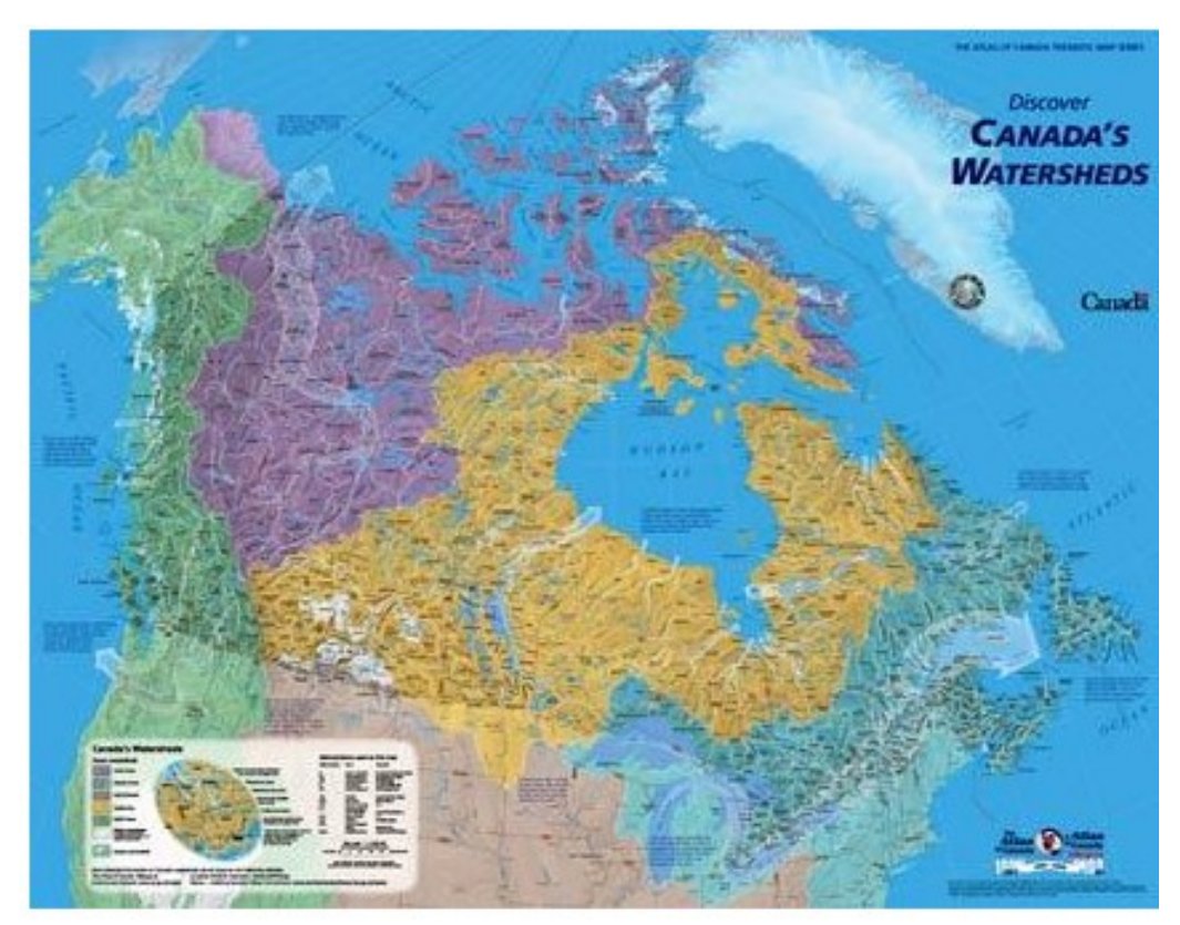
Environment Canada 2

Let's keep in mind that you and I consist of roughly 70% water, and that we are part of the hydrological cycle, part of the watersheds on which we live, not separate from them. The water I drink in Vancouver is the accumulation of millennia of rain, pooling, gathering and swelling into lakes and reservoirs in the Capilano and Seymour watersheds. Water connects us to places, people and creatures we have not seen, life that is far away from us, and life that came long before us.