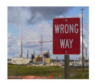
Regional Feature Rita Wong