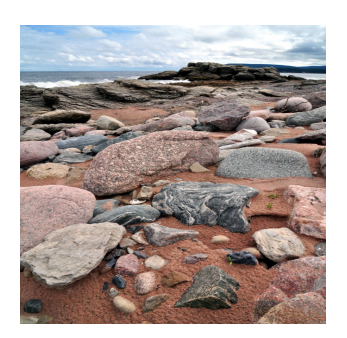
Edge Effects Tim Lilburn