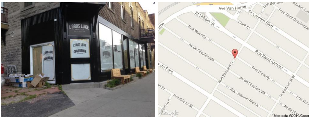
Fig. 4 and 5: Megafone, Montreal, 2013. < http://megafone.net/montreal/message/index >

phones and uploaded these concerns to the website of the project: megafone.net. 74 Since 2012, the Mobile Media Lab in Montreal became involved in the project and developed an android platform through which participants are able to document the spatial marginalization that people with disabilities encounter in the city of Montreal, although it stopped being updated in June 2014. The platform makes use of Google Maps as the base map layer and allows the publication of audio recordings, videos, texts and/or images onto an online map that shows the location in which participants experienced some sort of barrier or obstacle that disrupts their moving through the city; these included, for example, cars parked on sidewalks, holes in the pavement, sidewalks without ramps, stairs in main entrances, etc.