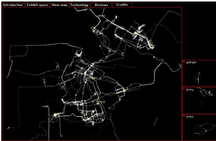
Fig. 3: Esther Polak, Waag Society, Amsterdam, 2002. < http://realtime.waag.org/ >

rhythms as a way to acknowledge the city as a living organism.