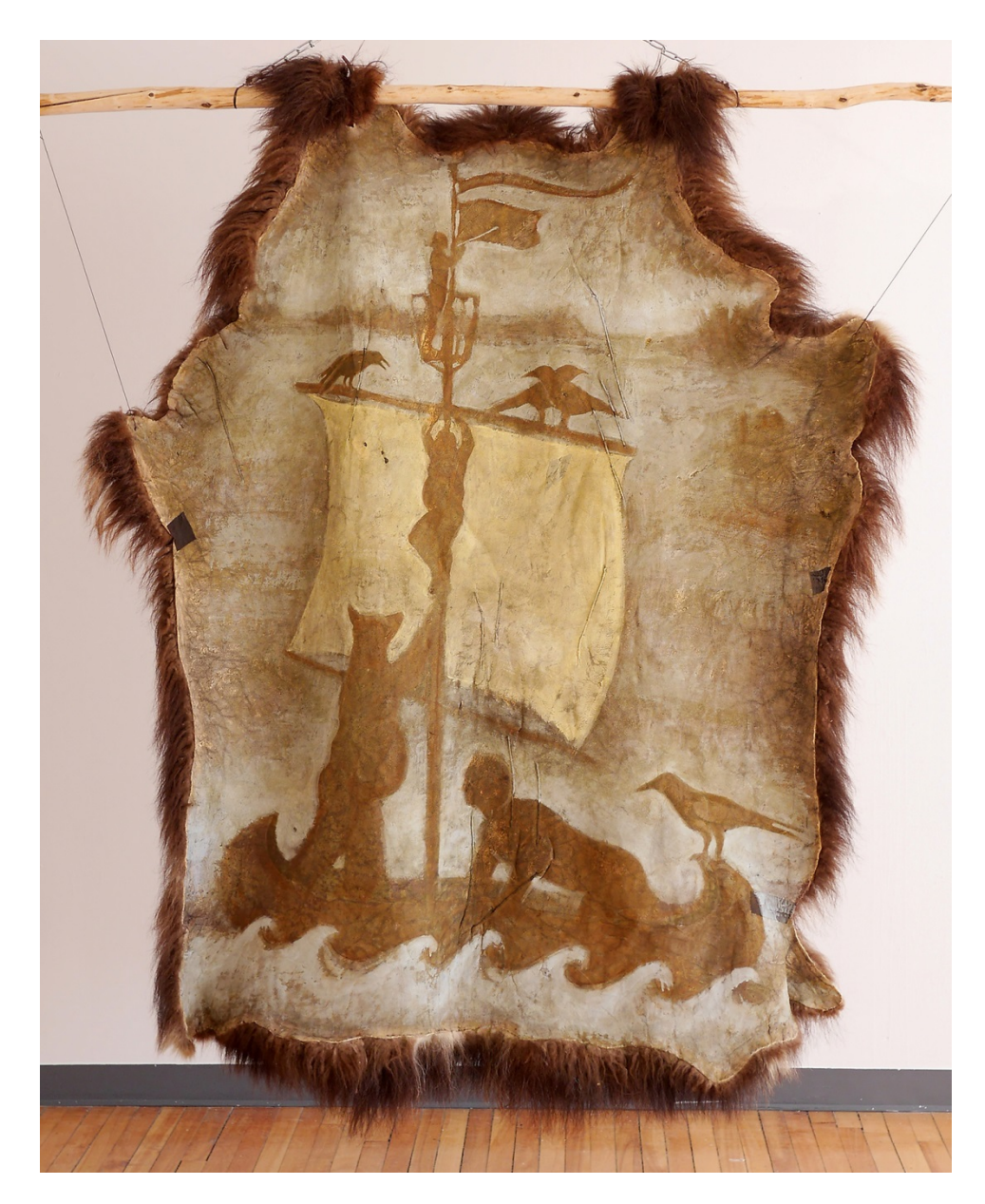
Image 6: The People of the Dream , Patrick DeCoste, 2014, acrylic on muskox skin, 6 x 6 feet.