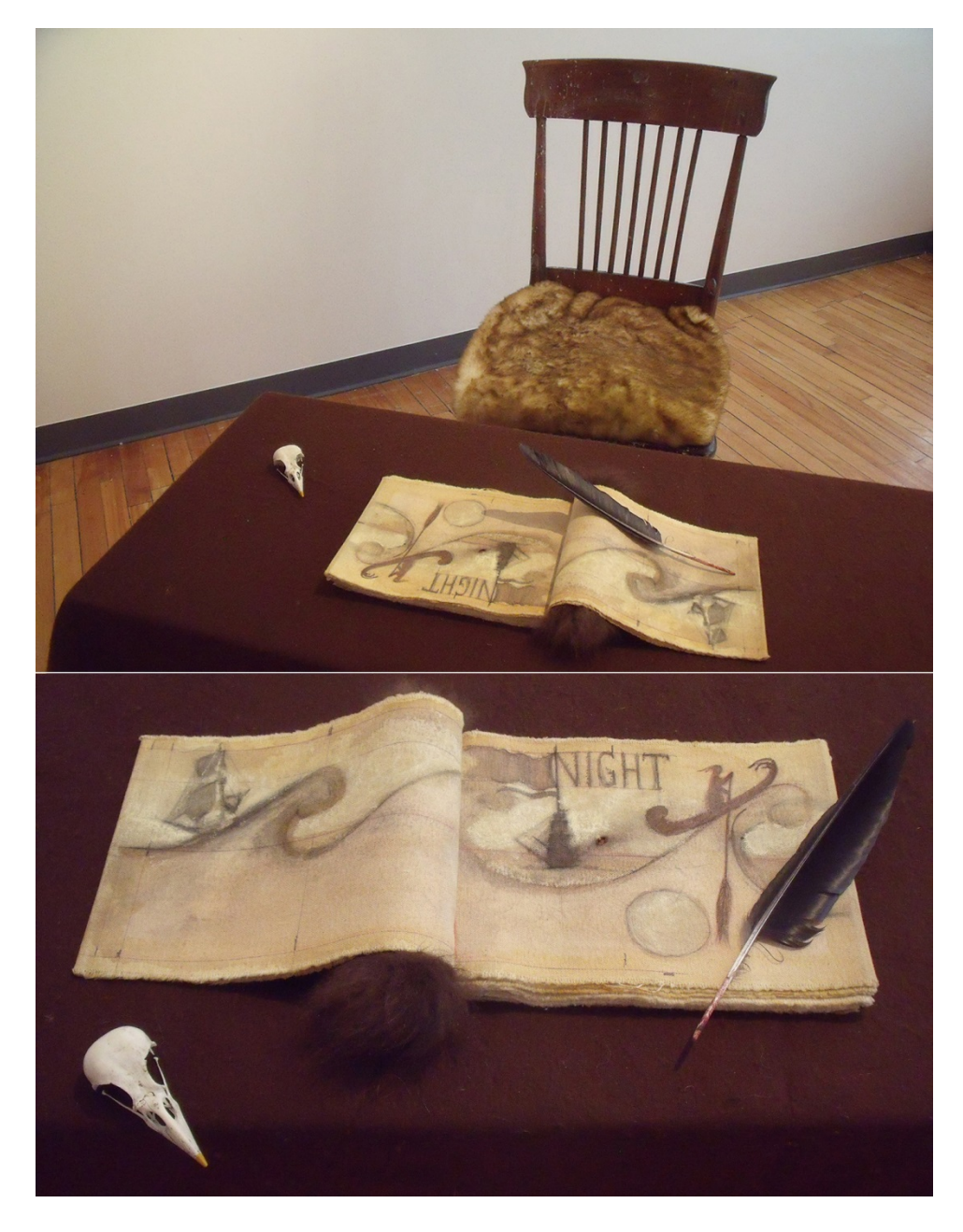
Image 11: The Dream , Patrick DeCoste, 2013, Book Work: pencil and acrylic on canvas, bound with mink fur. Reading & Writing Station: chair with faux fur, desk with felt, crow feather and skull.