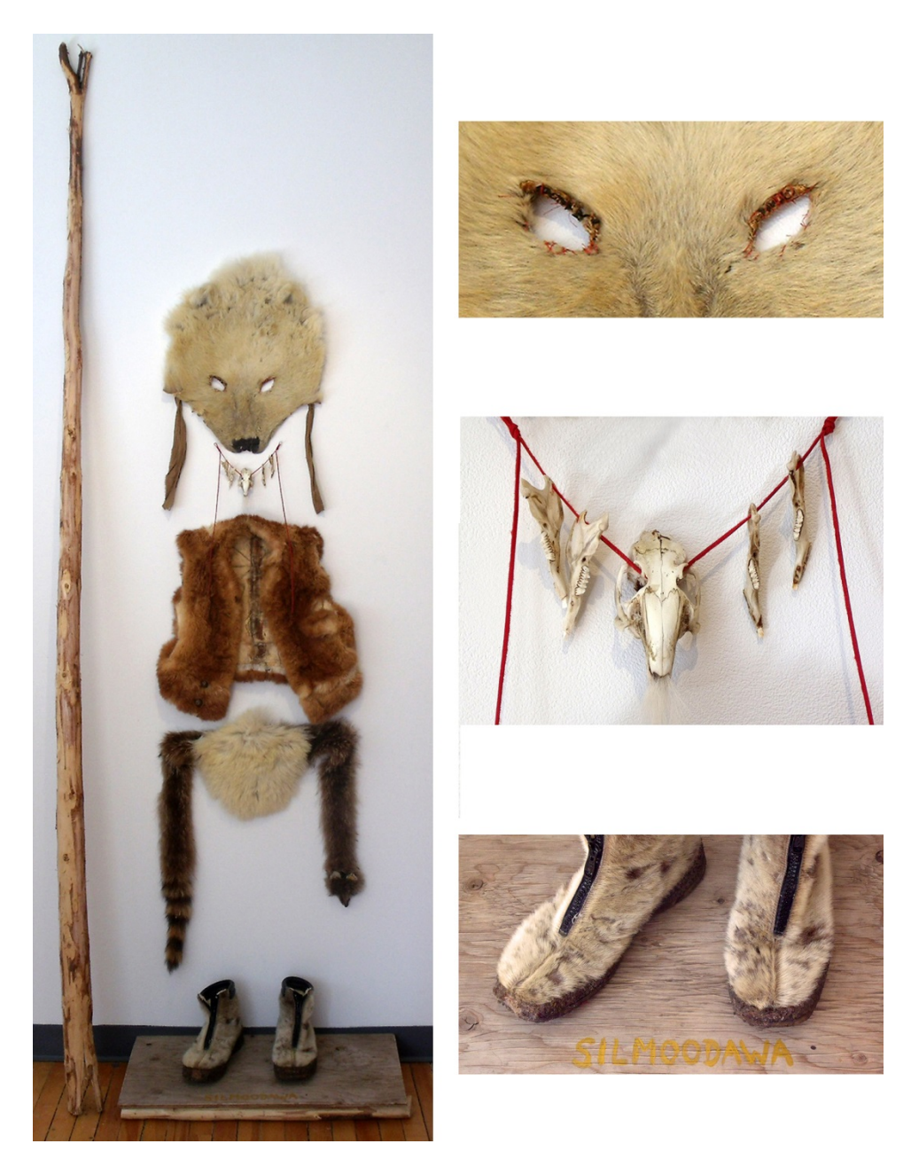
Image 10: The Man Dressed in Furs , Patrick DeCoste, 2014, various furs, rabbit bones, and wood, various dimensions.