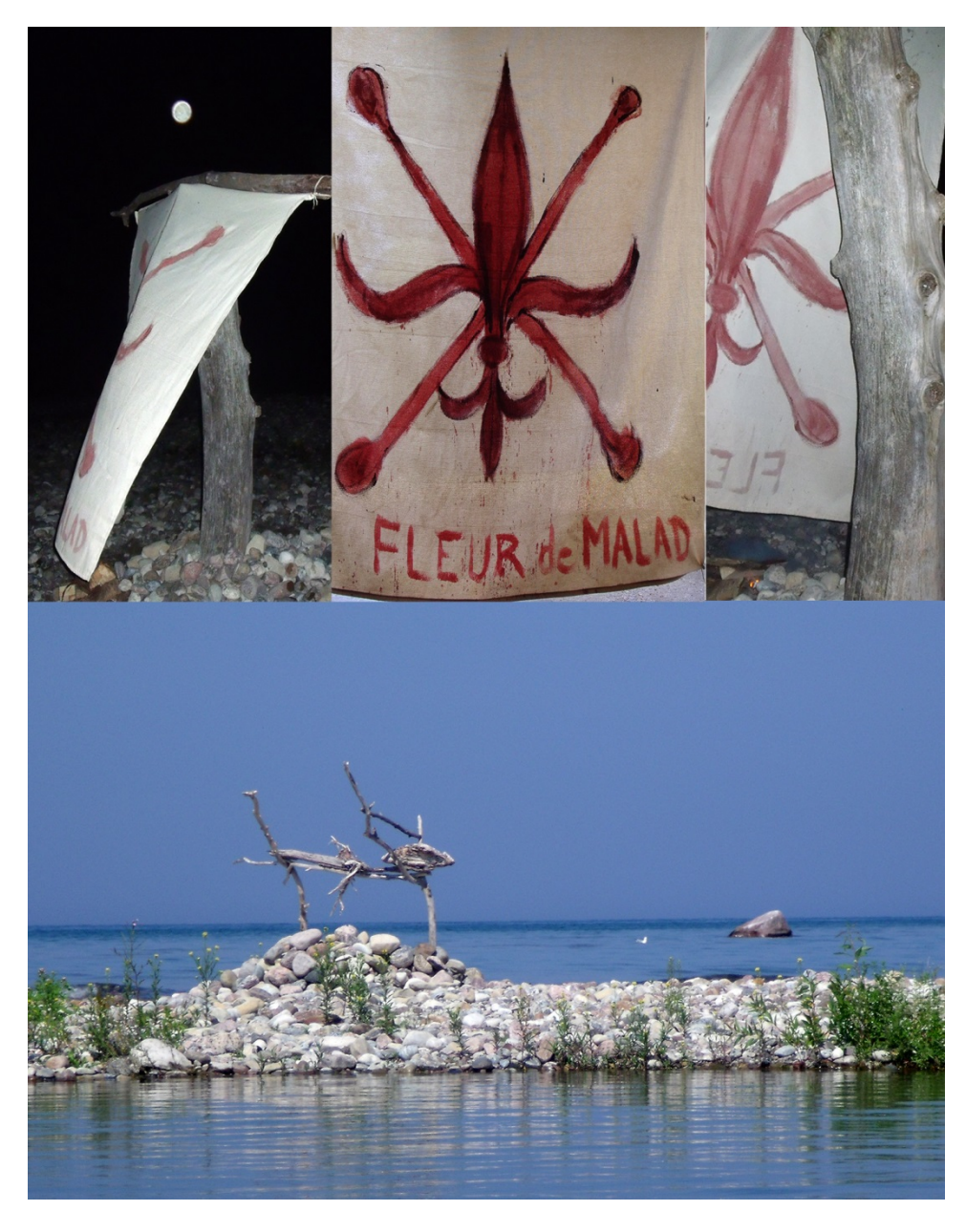
Image 3: Site as Simulation, The Floating Island, Georgian Bay, 2013, Patrick DeCoste.