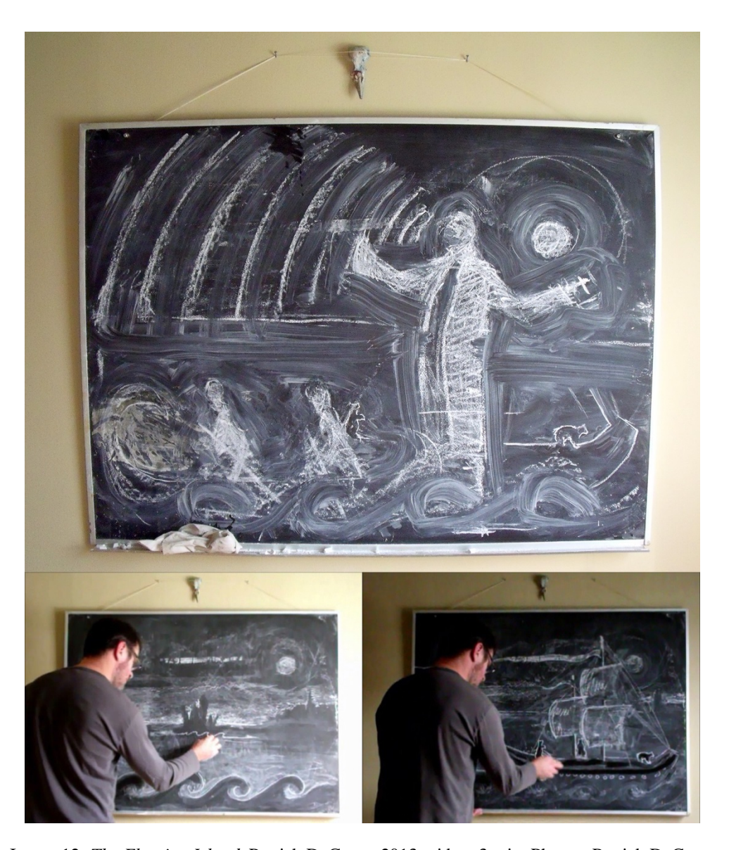
Image 12: The Floating Island, Patrick DeCoste, 2013, video, 3 min.