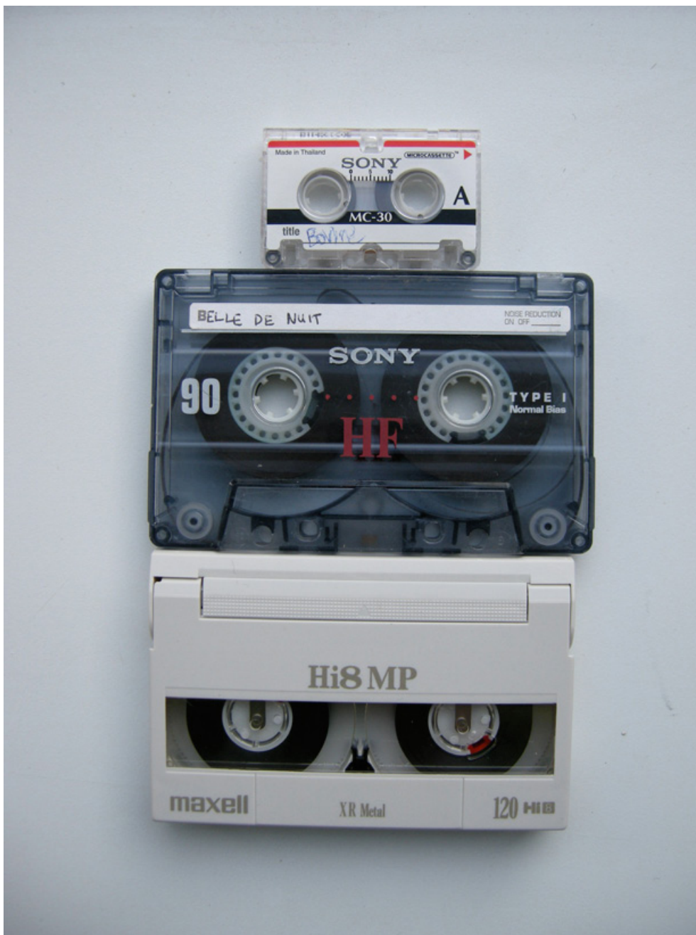
Figure 3. Belle de nuit . Digital photography. 11 x 17." 2011