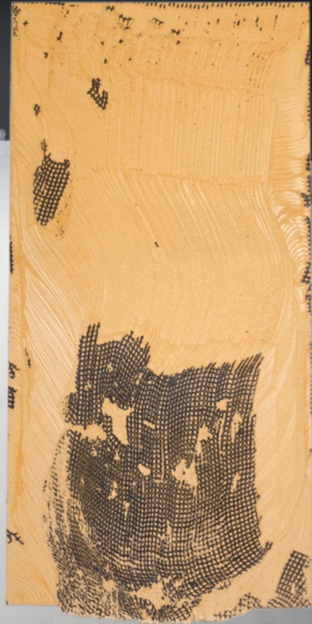
Alexis Harding, FT , 2004, 81" by 39 inches (courtesy the artist and Mummery + Schnelle).