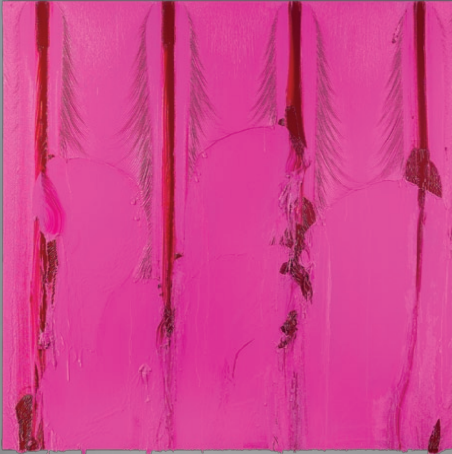
Alexis Harding, Flexible or Fixed? 2007, 72" by 72" (courtesy the artist and Mummery + Schnelle).

Krebber, you'll have noticed, figures nowhere in this story. Having agreed to participate, he began a meeting a few months later by stating that he couldn't possibly be in this (or, more or less, any) show: he had turned increasingly to archiving his career, protecting himself from the institutional apparatus that I represent. I can't say I wasn't frustrated by Krebber's feint, but I also can't decide whether it means he's in the show, or not.