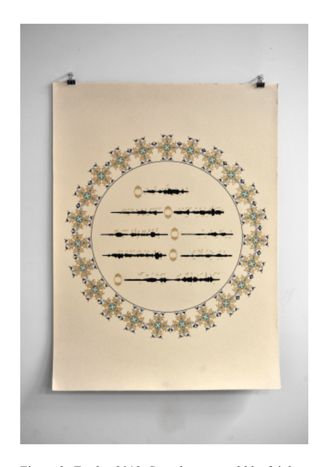
Figure 3. Fatiha, 2013. Soundwaves, gold leaf, ink