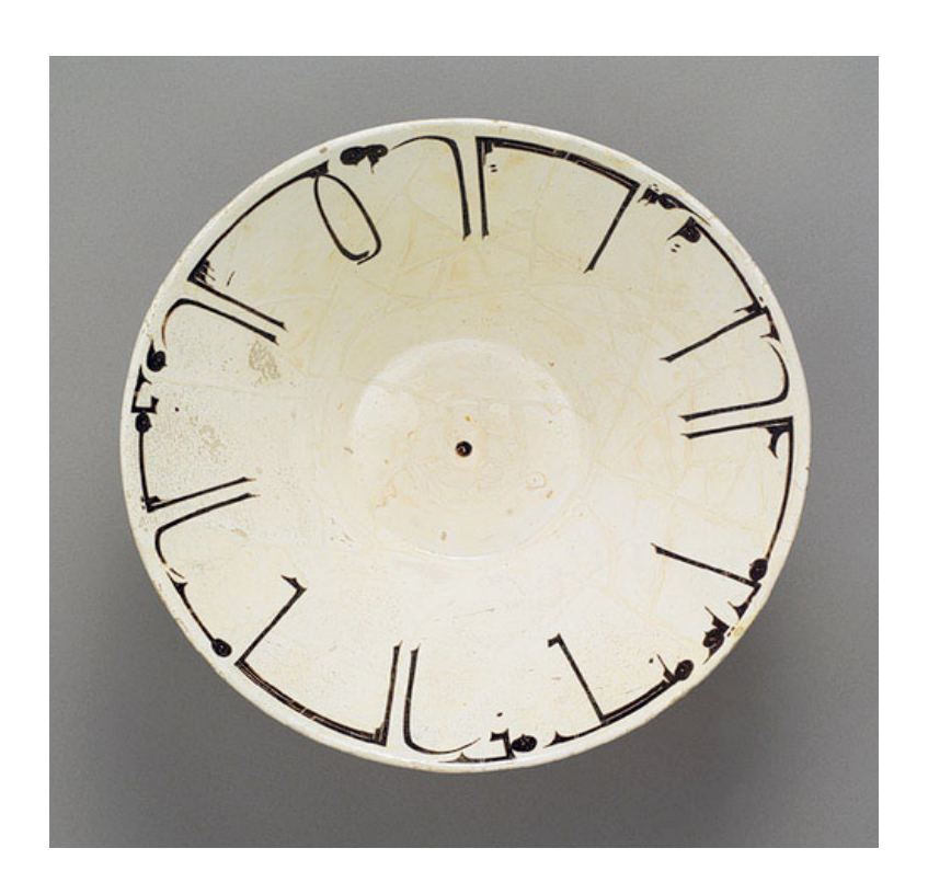
Figure 4. Bowl, 10<sup>th</sup> century.