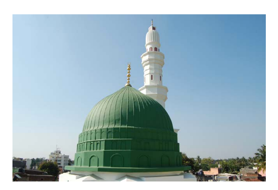
Figure 1. Al Madinah, Saudi Arabia, burial place of the Prophet Muhammad.