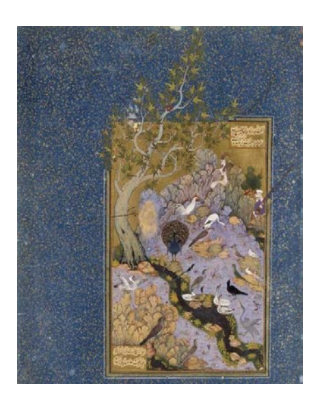
Figure 7. Mantiq Al-Tayr ( The Language of the Birds ), Habib Allah, Safavid dynasty, Persia, circa 1600.