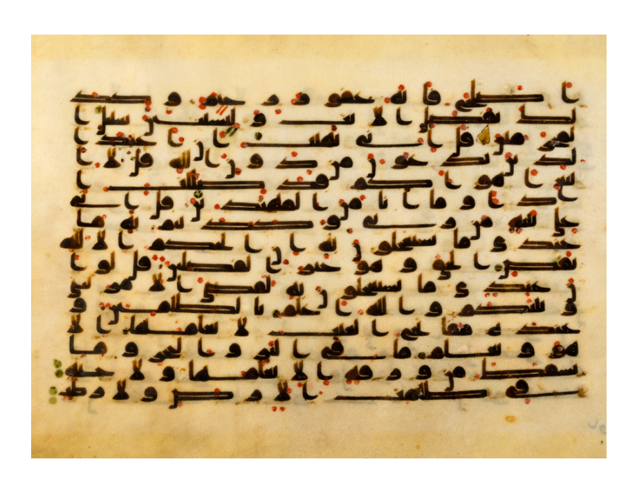
Figure 2. Leaf from the Qur'an, Middle East, 800–900.

Nasr says, "The Muslim lives in a space defined by the sound of the Qur'an" (1985, p. 4). The Qur'an has always been the starting point and the centre of many Islamic arts, as it is the crystallization of the divine word in human language. Mosques were built as places where the faithful could gather and hear the Qur'an recited, and Islamic calligraphy was created to write out the verses of the Qur'an in an ornate, decorative manner worthy of God (see Fig. 2). The art of illumination is, according to Nasr, "a visualization of the spiritual inspiration related to the writing and recitation of the text of the word of God" (1985, p. 5).