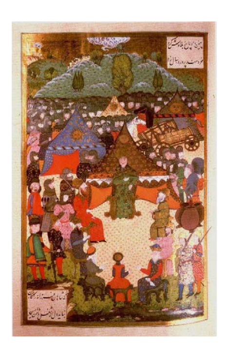
Figure 6. The King of Hungary, Lajos II, in council before the Battle of Mohacs Suleymanname, Ali, Amir Beg Shirwani, Istanbul, 1558.