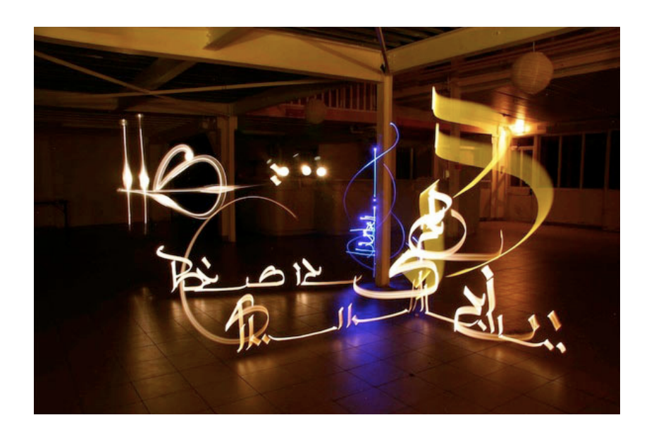
Figure 5. Poésie – Pol'n, Nantes, 2007

scriptures. He brought a new and contemporary approach to this historical discipline in what he calls "Light Calligraphy," creating powerful long-exposure photographs of precise movements and strokes of Arabic calligraphy using only a camera and a flashlight (see Fig. 5). Such creative explorations are evidence of the esthetic powers such art possesses. It is still alive and viable 1400 years after its creation. And people all over the world are inspired by it.