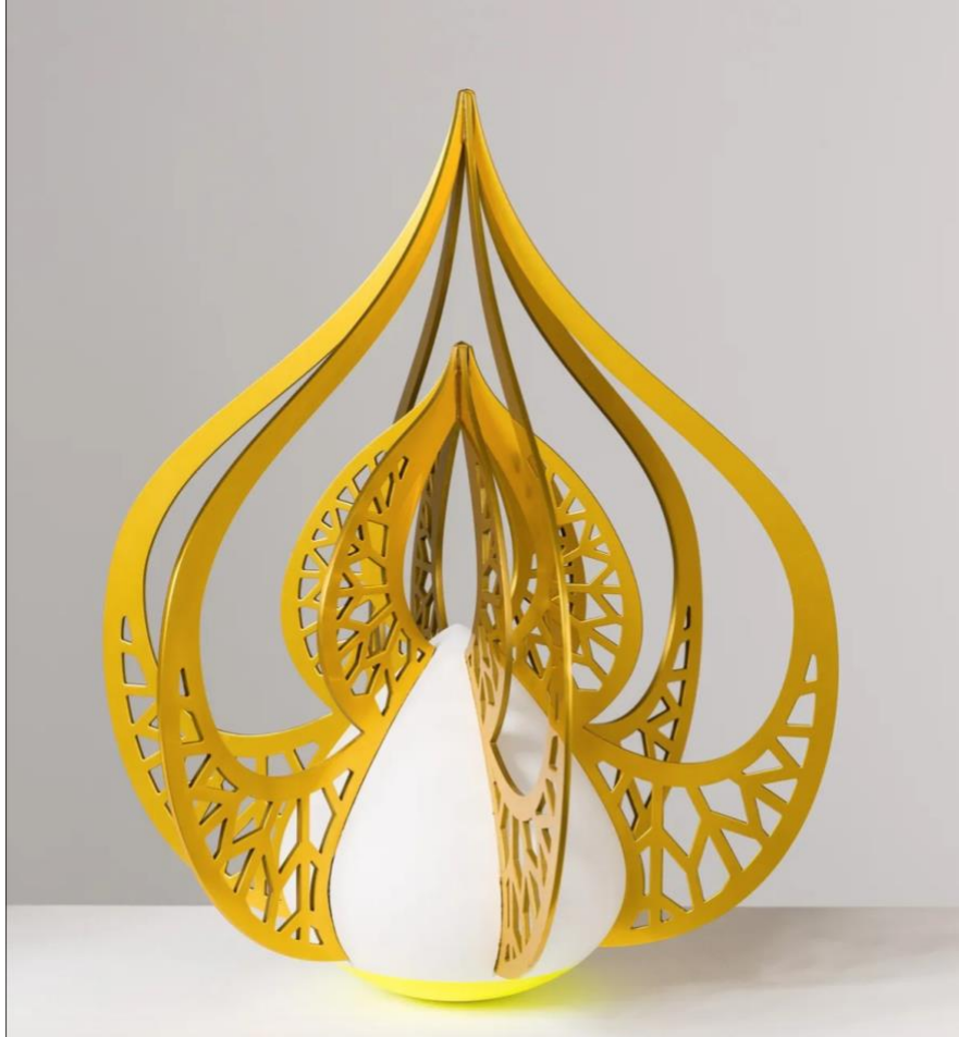
Figure 1.4 Untitled (Olla A) (2015) by Sherin Guirguis. Laser cut aluminum, wooden base

living between worlds. Must we always shed our cultural tradition and histories to live in the present diaspora?