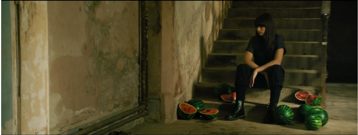
Figure 1.0 Familiar Phantoms (2023) by Larissa Sansour. Experimental documentary short film.

Inspired by anecdotes from family history and her childhood in Bethlehem, Sansour describes this film as her most personal to date. 17 Familiar Phantoms was shot in a derelict mansion and a black studio, with scenes that oscillate between slow sequences and fast-paced collages of objects, mementos, family photos and Super 8 footage. 18 Through a fluid and non-linear editing style that mimics the fragmentary and cyclical nature of memory itself, Sansour explores how stories - whether told, imagined or remembered - construct meanings generationally. The film documentary opens with an Arabic narration: “I know far too well that memory is a rogue agent, operating above the law of verifiability.” 19 This confession sets the tone for a film that embraces instability and the fleetingness of remembering. The decision to use Arabic narration while providing English subtitles is significant as it mirrors the lived experience of passive bilingualism, perhaps as