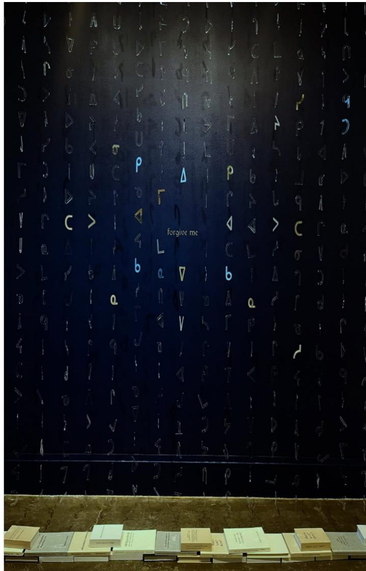
Figure 2.0 Forgive Me (2025) by Joi T. Arcand. Laser cut acrylic, textbooks.

Read together, these frameworks reveal that the loss and inaccessibility of community, cultural ties and language – whether through queer diasporic isolation or settler-colonial violence – is not incidental, but a strategic production of non-belonging. The severing of one’s mother tongue produces a shared condition of disorientation, where the inability to fully embody one’s language mirrors the difficulty of locating oneself within structures that have sought to erase it.