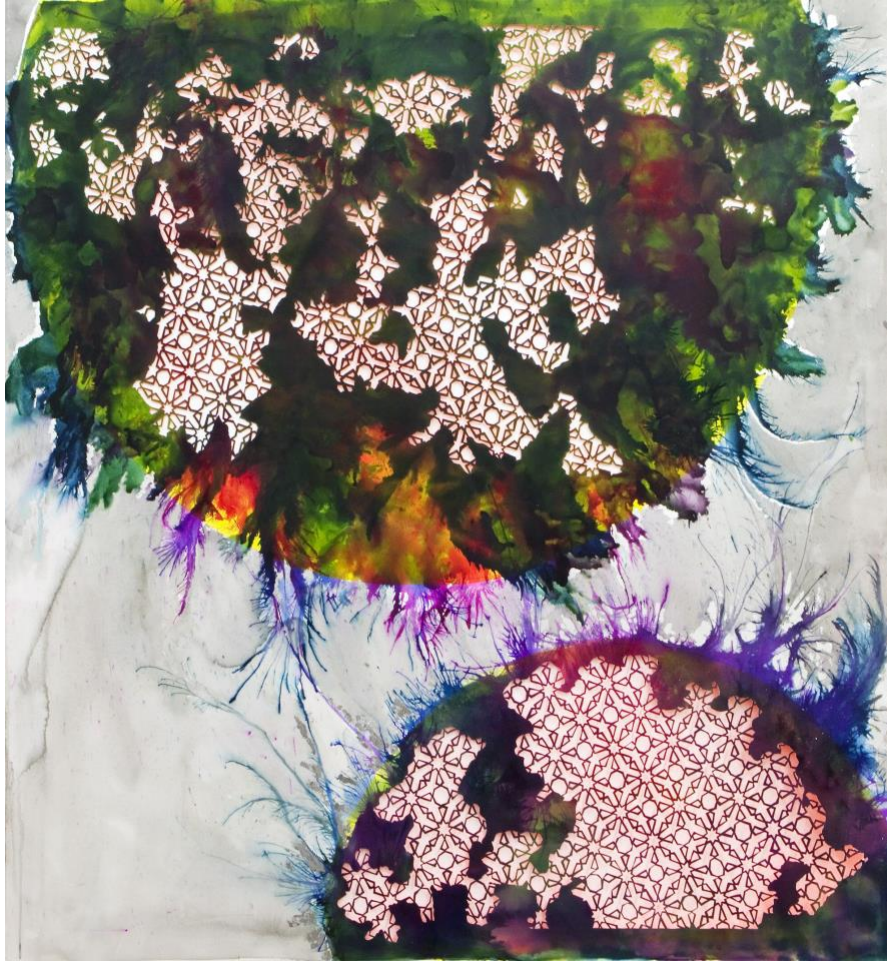
Figure 1.3 Untitled (Leil) (2012) by Sherin Guirguis. Media on hand-cut paper, foil, paint.

The text portion of this series explores what it means to identify with an idea of belonging and identity. Guirguis situates Rumi's poem on placelessness and tracelessness to convey the embodied, diasporic experience: