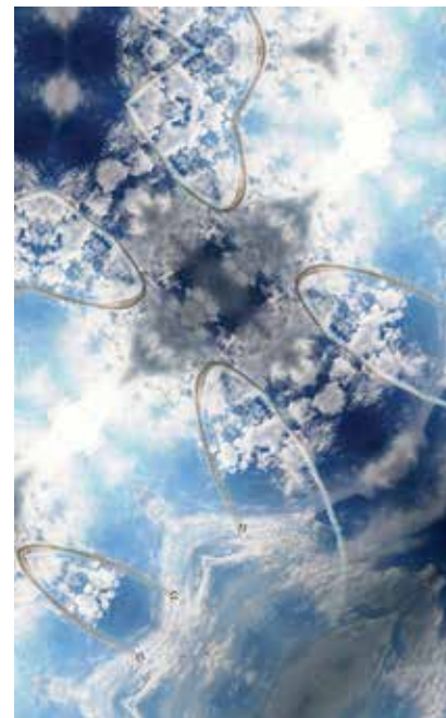
Sanaz Mazinani, Blue Angels (detail), 2013