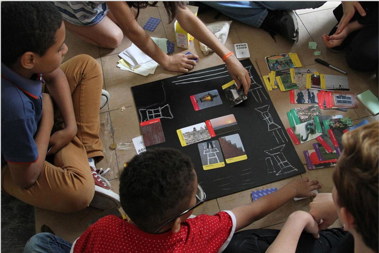
Figure 5. The game as a conversation method.

Each player must also fulfil a "secret objective" during the match. These objectives would be different for each player (e.g. a space to party, to read, to eat or to rest) and should emerge from the spatial exploration activities carried out previously. The tension between contrasting goals would introduce fun to the group and, at the same time, demonstrate how different elements might or might not satisfy very different activities. When carrying out the experience with the children from the squat, we were able to observe moments of negotiation and effective conversation between participants.