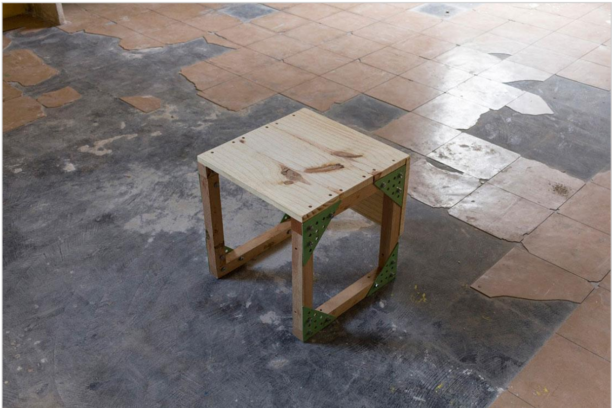
Figure 3. Bench block prototype demonstrating the use of metal connectors.

Starting from these “parts”, we work with two more levels of organisation: a set of recipes from already planned “blocks” and the resulting “micro-architectures.” One of the simplest “blocks” is similar to the idea of a bench where it is possible to see the use and combination of the “parts” (Figure 3). In this organisation, although a given “micro-architecture” does not need to incorporate any predefined “block”, it can still go the opposite direction where the division of a specific “micro-architecture” could feed the list of building “blocks.”