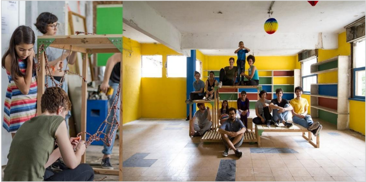
Figure 2. Assembling a micro-architecture.