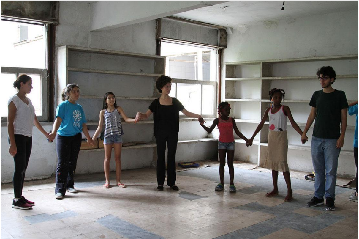
Figure 4. Group plays as a way of exploring the relationship between body and space.

At the “systematization” level, we proposed to work with playing cards, trying to understand them also under the principle of modularity already present in the parts and blocks.