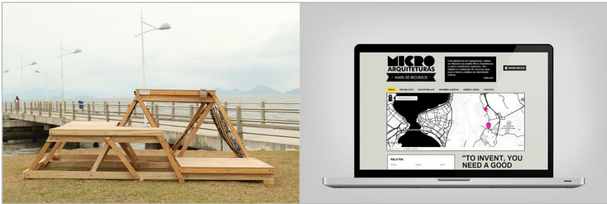
Figure 1. Micro-Architectures (2014)— The first constructed structure and the collective mapping platform.

A few years later, when we received the 11h Biennial's invitation to reenact the project, our context was different, as were some of our concerns. From our incursions into systemic thinking, we saw this as an opportunity to effectively act cybernetically in the process of design (Glanville, 2015).