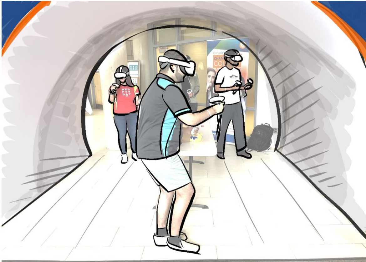
Figure 3. Multi-person VR Engagement