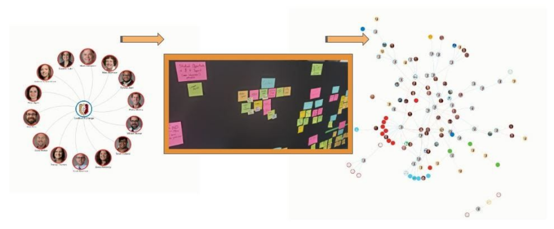
Figure 1: Coalition for Change Process Visual

align initiatives across departments, academic centers, student organizations, and community organizations