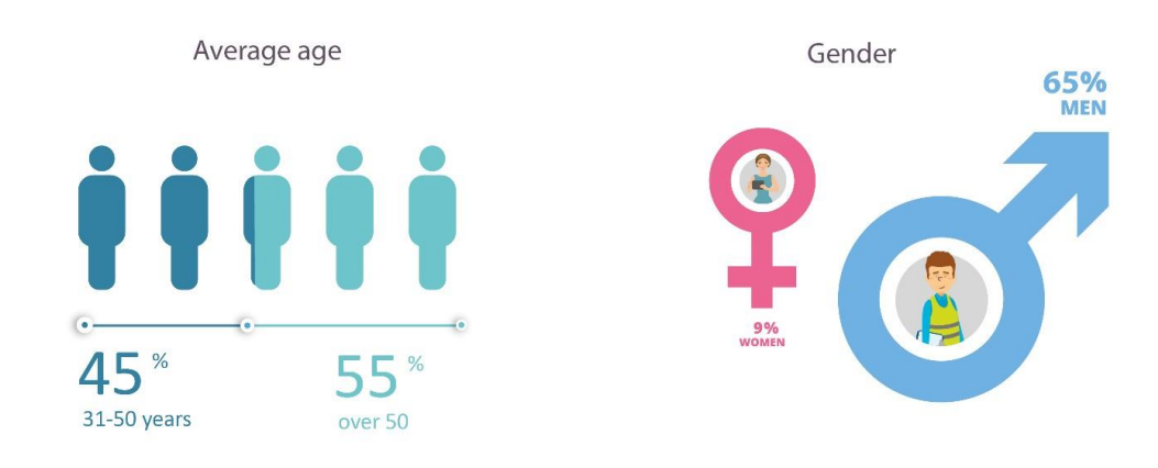
Figure 3. Agridea's workforce gender and age

information was collected through interviews with the department managers (Gardeners, Cemeteries, Recycle) and designer took part in the weekly meetings in which the problems faced during the week were brought out. In this way, immediate feedback on the validity of the gathered data is provided. Afterwards, the evolution and composition analysis of cooperative the second steps of HD focused to examine the organizational structure to identify and map criticalities as well as potentialities and positive characteristic. This is the preliminary step for the redesign of cooperative structure and management assets.