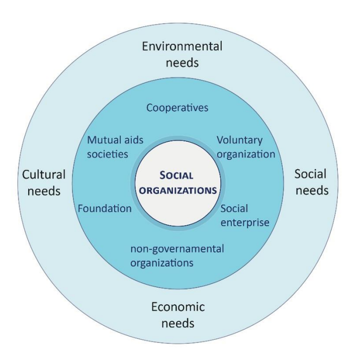
Figure 1. Social organization (author's elaboration)

In this background, the present paper intends to contribute to the literature exploring the organizational strategies and solutions put into practice by social cooperatives that make them able to resist crises and market changes. Moreover, through the application of Systemic Design approach organizational criticalities and development