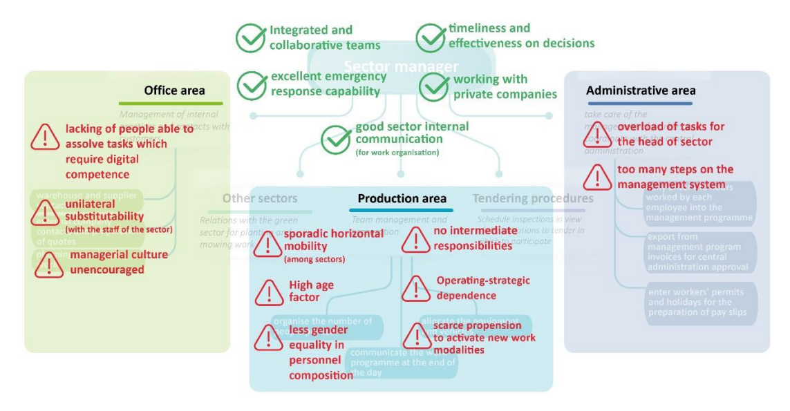
Figure 4. Criticalities and potentialities in organization

Moreover, thanks to the HD peculiarities and characteristic of people who compose the organizational chart emerge allowing a deepened comprehension of cooperative environment and management strategies adopted. (Fig.5)