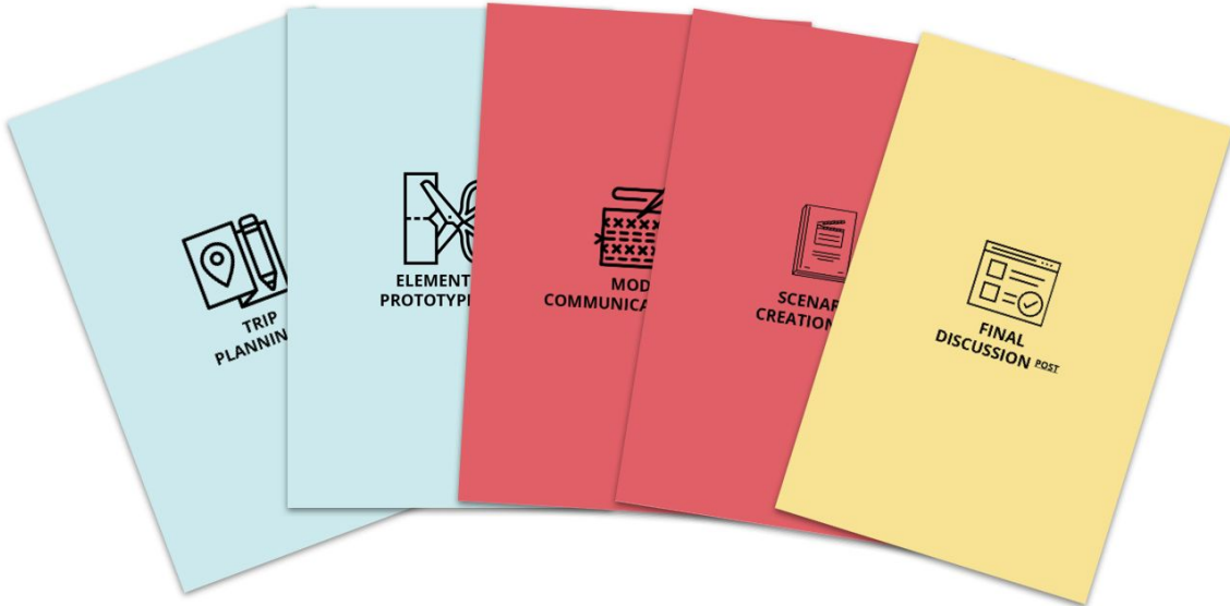
Photo 1: Craft collaboration toolkit, selected cards, front Pre: Light blue, During: Orange, Post: Yellow