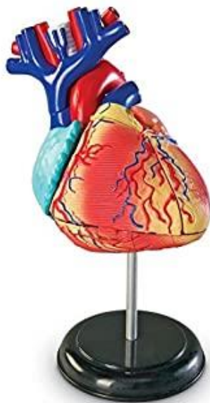
Figure 4: Walter Products Heart Model

The model, when it arrived, was a shock to me. I have read descriptions of hearts in textbooks, and received “heart-shaped” cards on Valentine’s day; from those experiences, I had formed a mental model of what the human heart is shaped like. It was nothing like the shape of this actual model.