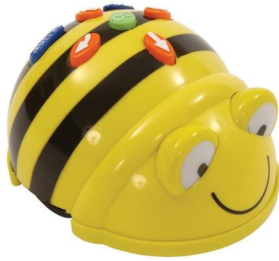
Figure 1: Bee-Bot

Kabátová et al. (2012) describe using Bee-Bots to teach informatics at a school for visually impaired children, in Slovakia. They found the Bee-Bot to be very accessible for children with visual impairment, in part because of the design of its buttons (Kabátová et al., 2012, p. 24). They note that in addition to being different colors, the buttons which control Bee-Bots are embossed with raised symbols, and they are also different shapes. This makes the control buttons tactilely distinguishable. Although the lines on the plastic mats were not raised, so impossible to perceive by touch, they modified them by placing tape and cardboard over the lines.