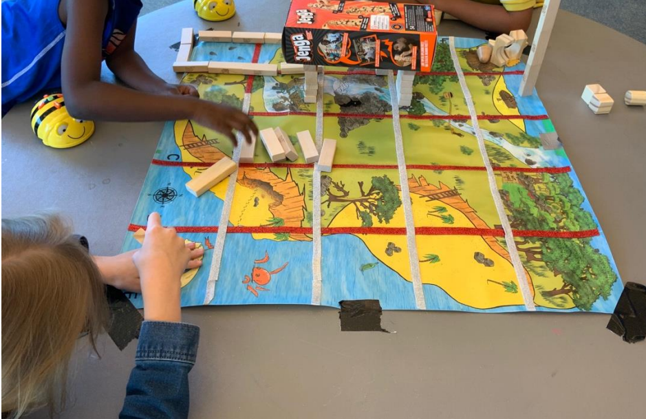
Figure 5: Bee-Bots traveling on raised mat grids

Before beginning activities with Bee-Bots, the facilitator of the activity would describe the functions of their various buttons in a systematic way. Descriptions such as “Press the green button to make the Bee-Bot start driving” would not be helpful for campers unable to distinguish colors, so more detailed descriptions would be provided. A facilitator might say, “If you trace your hand back from the front of the Bee-Bot, where its eyes and head are, the first button you should come to is a forward button. After that is a round button, which is green. This round button makes the Bee-Bot start driving...” After such explanations, the activities could start.