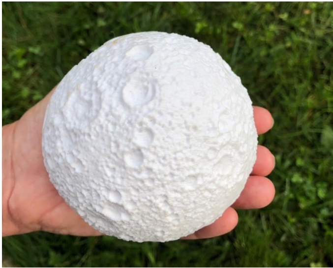
Figure 3: 3D Printed Moon Surface

I found a moon model, in the stereolithography file format, I.E. with the file extension, stl, which can be printed by most 3D printers. The model was programmatically generated by a Wikipedia user, based on laser altimeter data collected by NASA's Lunar Reconnaissance Orbiter space craft (User: Cmglee, 2020). It exaggerates real elevations by a factor of ten, to accentuate the moon's surface features.