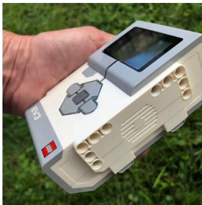
Figure 2: EV3 Lego Robot

Ludi and Reichlmayr (2011) ran a series of workshops for visually impaired young adults using Lego Mindstorms NXT robots. Rather than have students build the robots, they focused on getting students to program them. The apps which Lego makes available for programming its Mindstorms robots use very graphical interfaces, which are not accessible without vision, so Ludi and Reichlmayr set out to find a different software package which would meet the accessibility needs of their project. They selected an open-source programming environment, called BricxCC, which now, in 2020, has not been updated in several years.