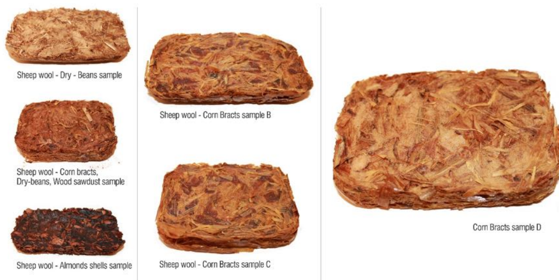
Figure 4. Samples produced in laboratory, combining sheep wool with different selected agri-food by products.

Despite. Almond-shells haven't a fibrous structure, can were considered an interesting possible "charge" for the insulation panel because of their "quarry" section, which in nature has exactly the purpose of insulating and protecting the almond seed inside. However, during the sample production their aggregation abilities with the wool before entering the chemical bath proved to be limited. So, in order to achieve a proper cohesion between the matrix and the charge, the chemical treatment was prolonged, with a greater production of keratin glue. The result is a sample showing limited thickness high density and low flexibility. Compared to the other samples, the almond shells one proved to be more fragile and less workable than the others, so was not considered suitable for thermal insulation purposes, while other kind of uses in building components could be considered anyway.