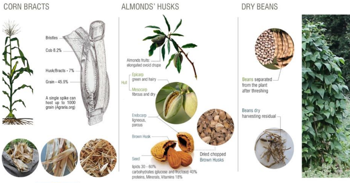
Figure 3. Selected by-products features