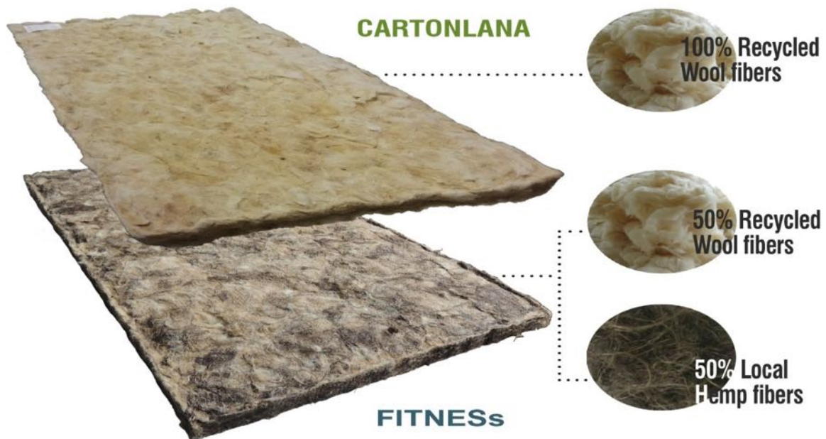
Figure 2. Cartonlana and FITNESSs panels composition

competitive sound absorption coefficient value, measured in \alpha_w=0,75 MH, slightly improved if compared to Cartonlana 's \alpha_w=0,55 MH (Pennacchio et al. 2017).