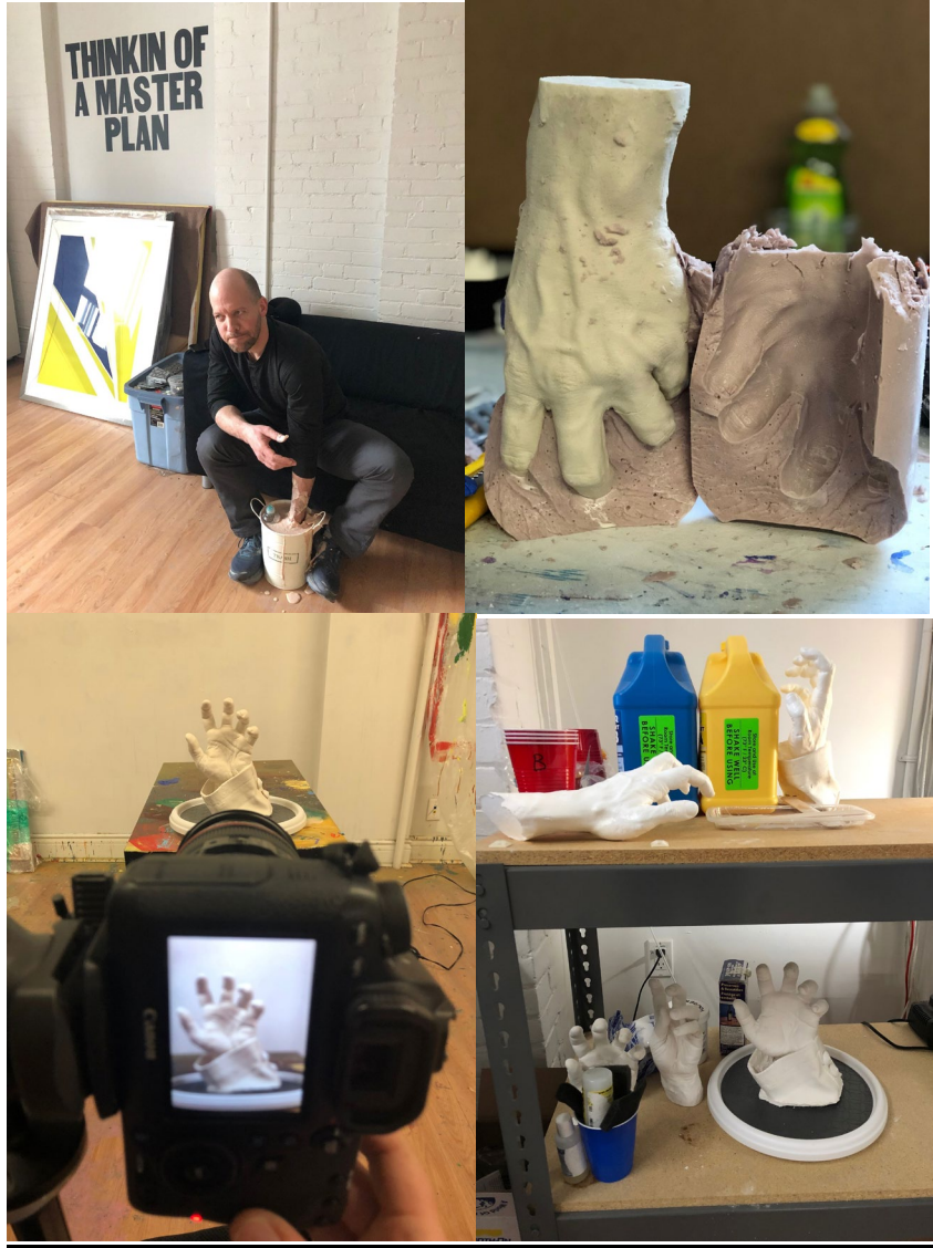
Fig. 11-14. Process