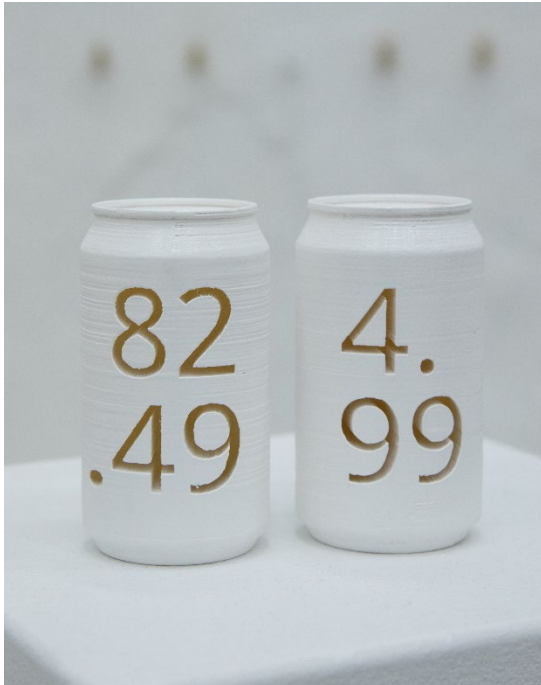
(Fig. 3.) Have a Coke in gallery

Medium: Cast aluminum and 3D prints. Iterations: Two aluminum, 11 3D printed versions.