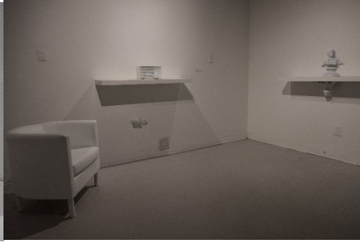
Fig. 17. Wide shot of installation of radio

Medium: Repurposed vintage radio, Adafruit Feather microcontroller and Featherwing Musicmaker. Iterations: Current work in progress.