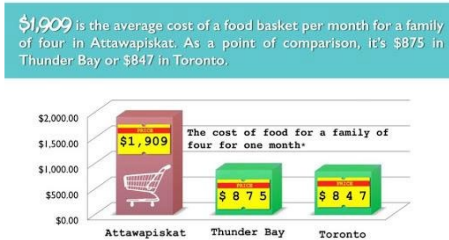
(Fig. 4.)

raspberries priced at $0.50 CAD a piece (White, 2018) and a case of orange soda routinely selling for over $26 CAD (Murray, 2016).