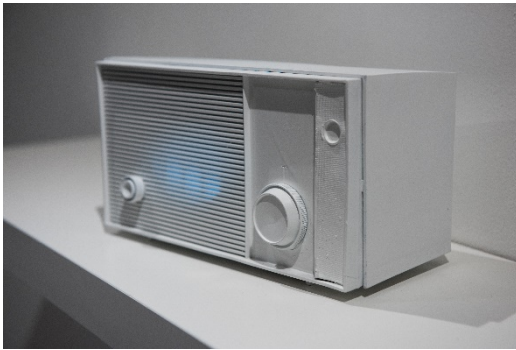
Fig. 16. Radio in gallery