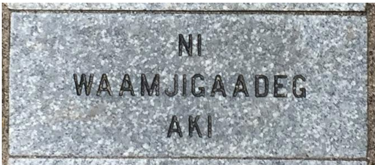
Fig.1. Stone #3 , courtesy of the artist.

Couchie writes, “By intervening in Barrie’s attempt to maintain the status quo, Land quietly disrupts the settler-narrative through the insertion of Indigenous presence. Its intended function is to serve as resistance to Indigenous erasure and as a permanent land acknowledgement” (20).