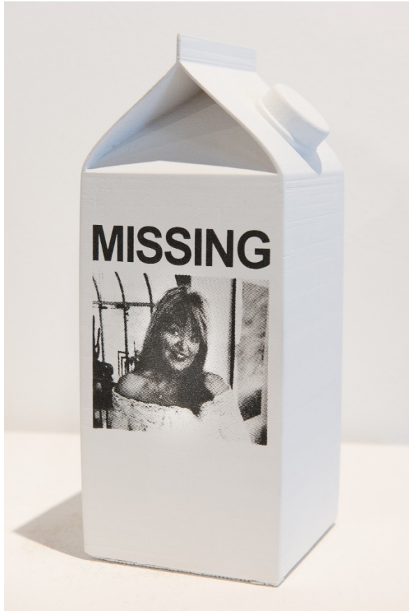
Fig. 8. Final result in gallery.