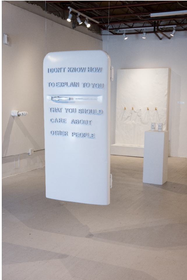
Fig. 15. Installation view.

Medium: Found fridge door, magnets. Iterations: Found one fridge door, ground off rust using an angle grinder.