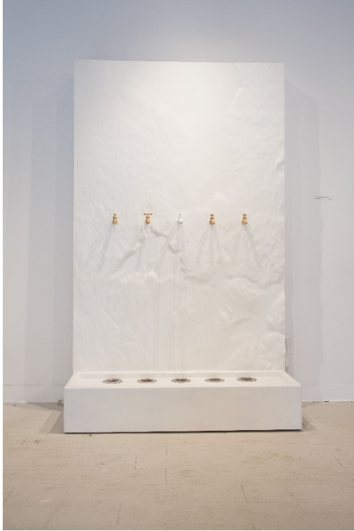
Fig. 5. Final version in operation at the Toronto Media Arts Centre.