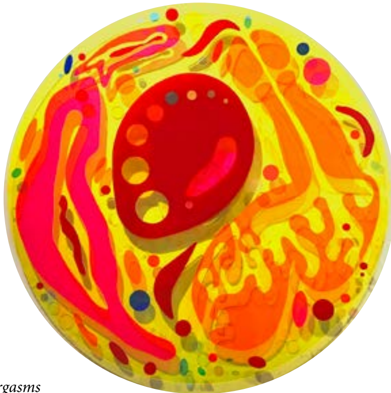
Figure 6 Material Organ Orgasms 30 inches in diameter