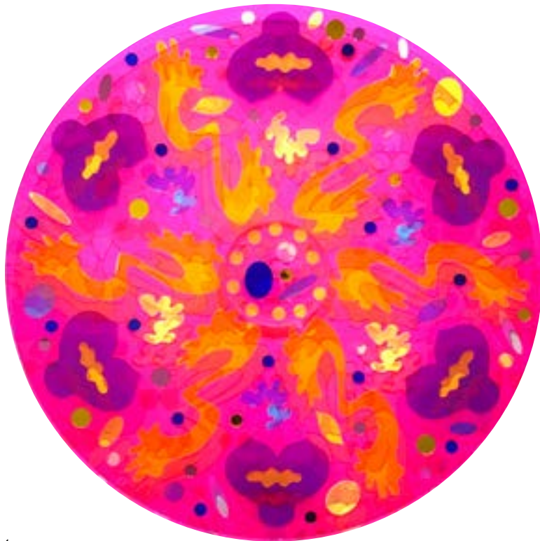
Figure 7 Pulsing Pinkness 30 inches in diameter