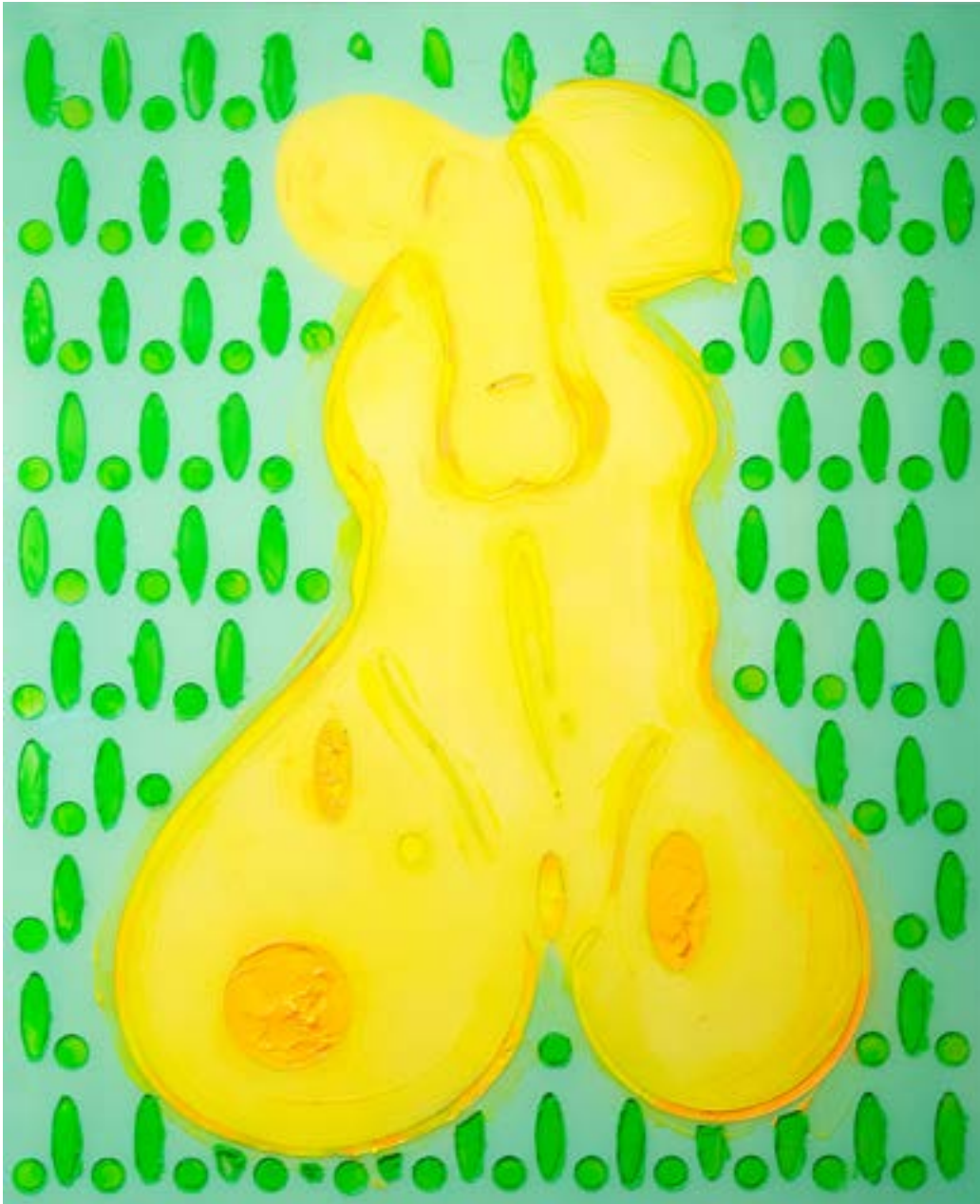
Figure 8 Realized Materialized 36 x 44 inches