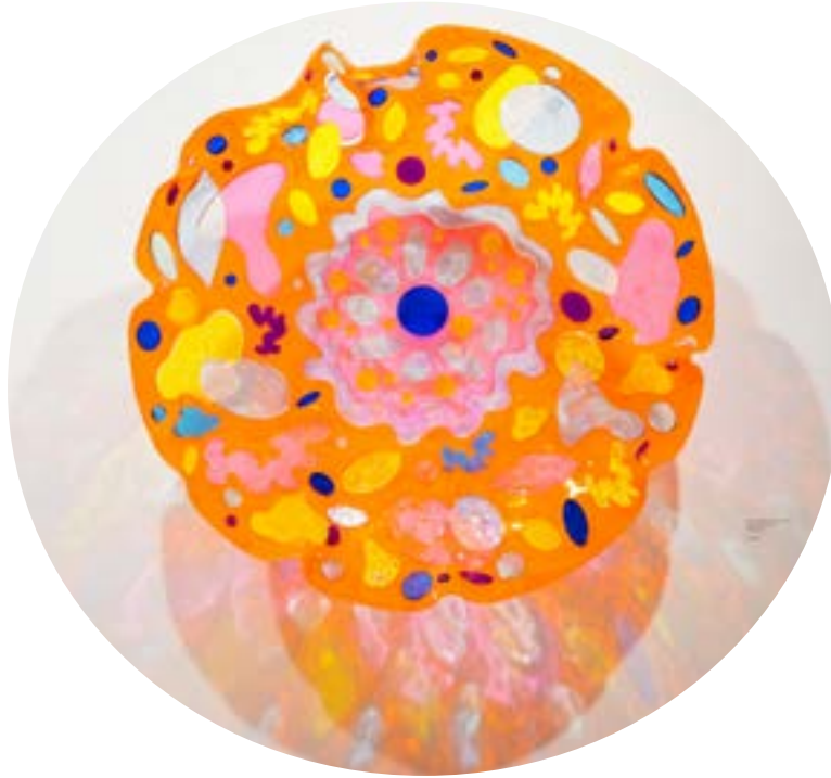
Figure 3 Surging, Merging, Matter 30 inches in diameter