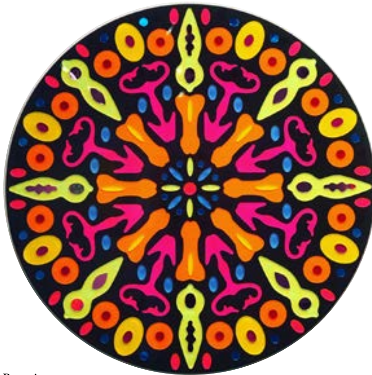
Figure 4 Coming Colour: A Renaissance 30 inches in diameter