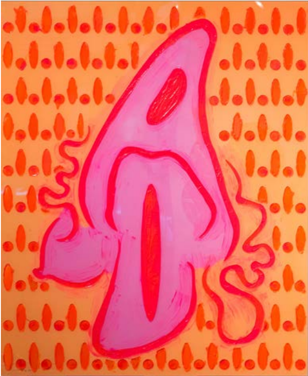
Figure 9 Broken Matters 36 x 44 inches