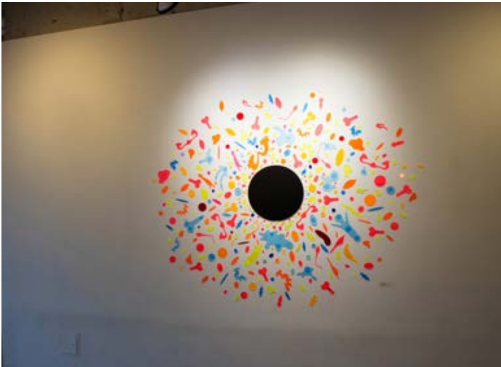
Figure 10 (W)hole Material