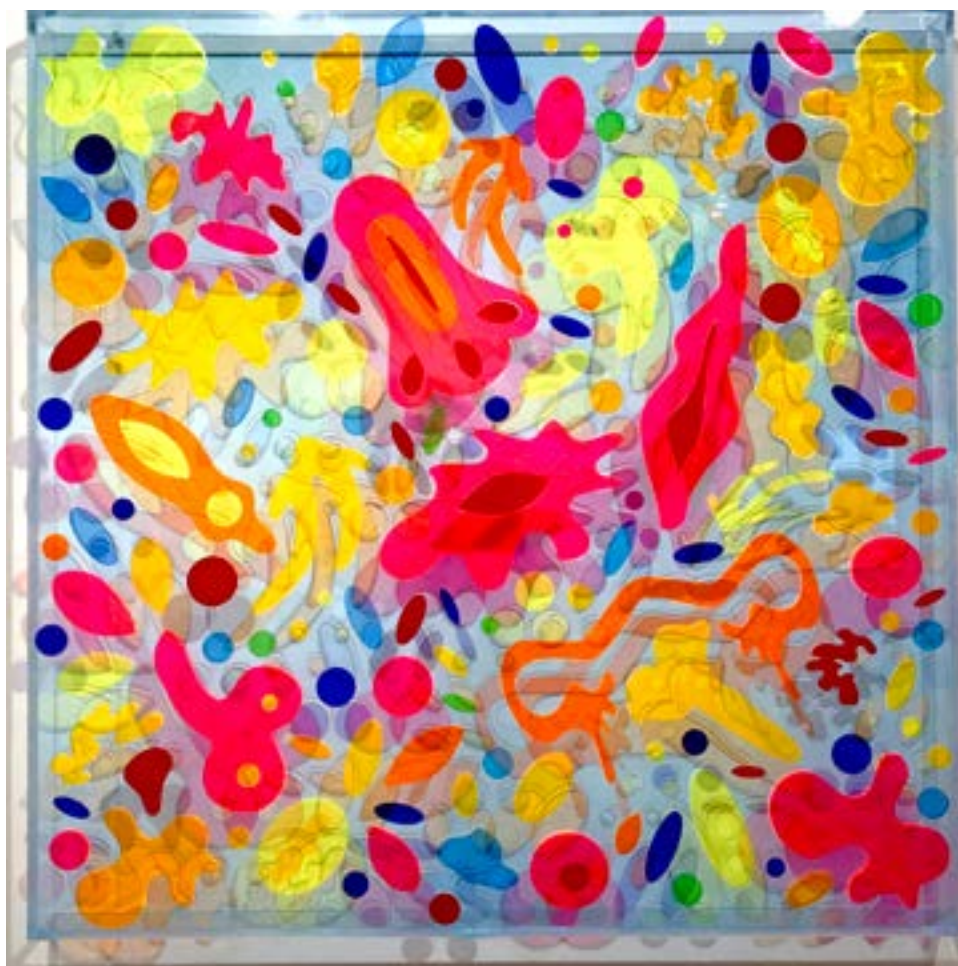
Figure 2 For the Love of Colour: A Chromophilia Delight, Right Panel detail, 2019 36 x 36 inches