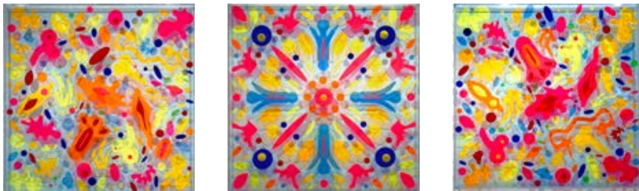
Figure 1 For the Love of Colour: A Chromophilia Delight Triptych, 2019 36 x 36 inches each