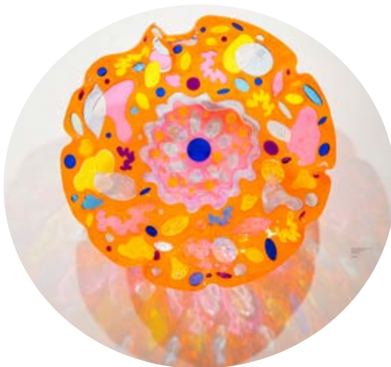
Figure 3 Surging, Merging, Matter 30 inches in diameter