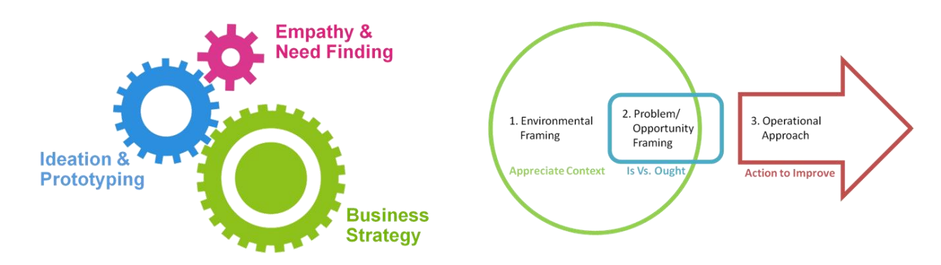
Figure 1. Rotman's Design Thinking Methodology and the U.S. Army's Design Methodology.