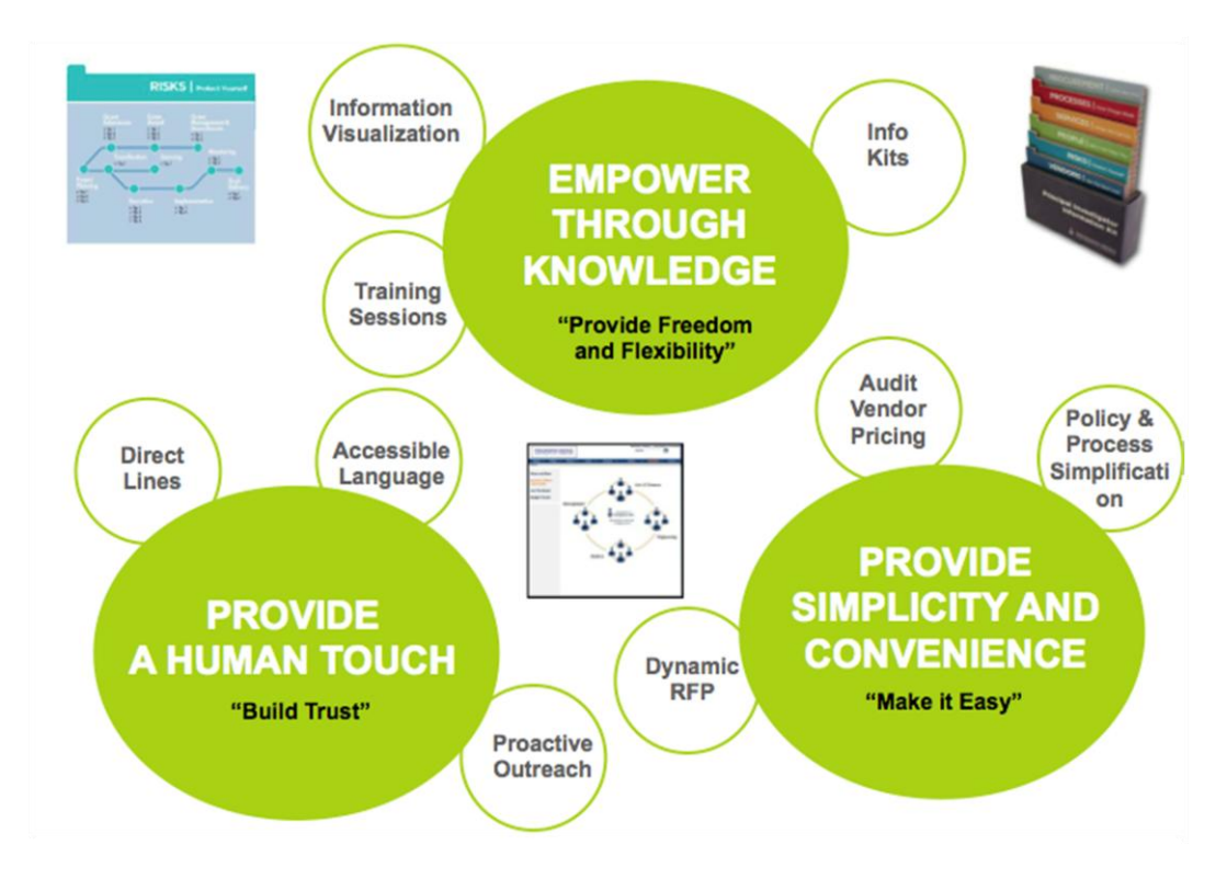
Figure 2. An activity system for better meeting the needs of end users of the University of Toronto's Procurement Services.

As a result of this project, user retention rates for Procurement Services jumped from 40% to 99%. In the first year, the pilot program was estimated to have returned $1.5 million in savings. In 2012, Procurement Services received the CUABO industry award for their innovative negotiable RFP process and the University of Toronto's Excellence through Innovation award.