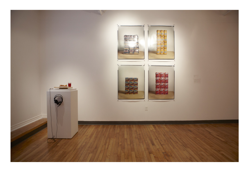
Figure 6: Keesic Douglas, 4 Reservation Food Groups (2010). Four chromagenic prints, Cheez Whiz, Kam, Wonderbread, Kool-Aid, water, audio file of Mark Douglas telling his Kam story.