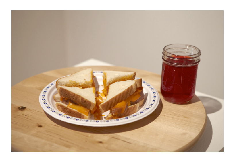
Figure 7: Keesic Douglas, 4 Reservation Food Groups (2010). Detail of sandwich and Kool-Aid.