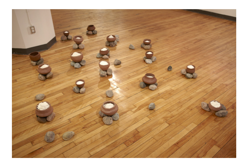
Figure 3: KC Adams, The Gift That Keeps on Giving (2011). Clay pots, river rocks, white flour, white sugar, salt, milk and lard.