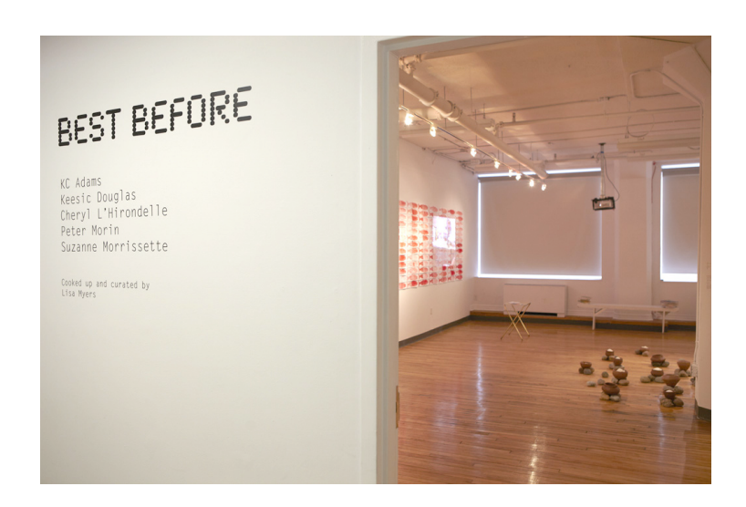
Figure 2: Best Before at Graduate Gallery, OCAD University (2011). View of entrance.