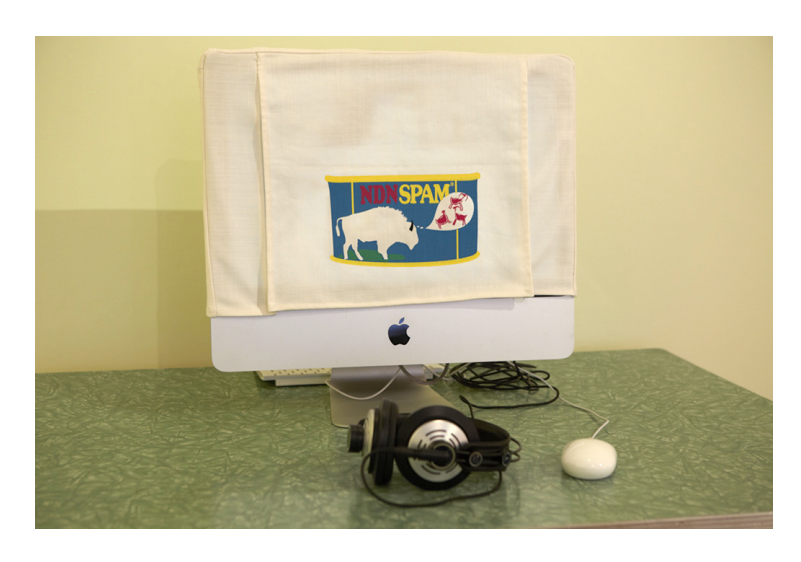
Figure 10: Cheryl L'Hirondelle, NDNSPAM Cookbook (2011). Detail of NDNSPAM iMac cozy .