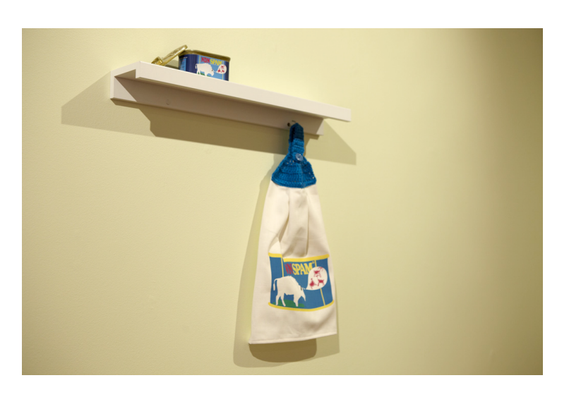
Figure 9: Cheryl L'Hirondelle, NDNSPAM Cookbook (2011). Detail of NDNSPAM crocheted tea towel and NDNSPAM can .