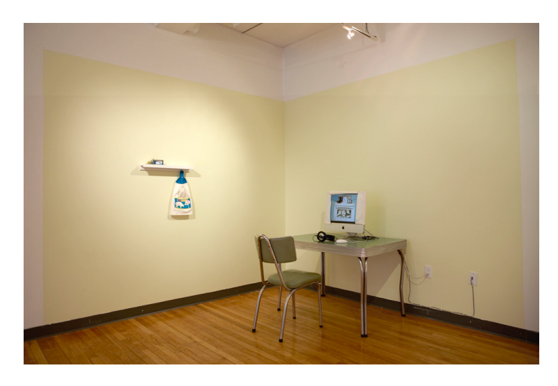
Figure 8: Cheryl L'Hirondelle, NDNSPAM Cookbook (2011). Preview of NDNSPAM Celebrity Edition Cookbook Website (commissioned by Tribe Inc.), NDNSPAM crocheted tea towel, NDNSPAM can, NDNSPAM iMac cozy.