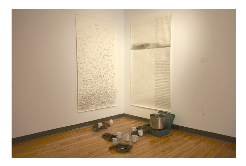
Figure 4: Suzanne Morrissette, solve for spur to bum area, for some (2011). Paper, pencil, pen, ink, metal screen, electric stove elements, camping stove, stock pot, and Labrador Tea.