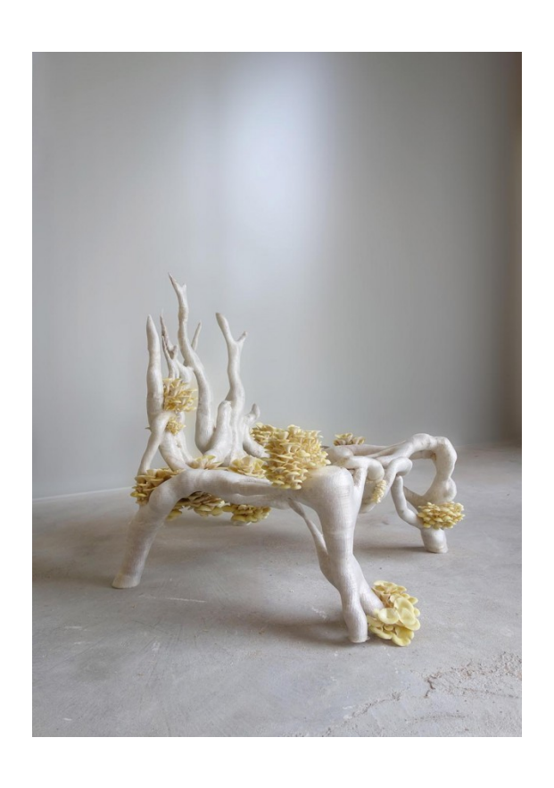
Fig. 10 Myceliumchair, 2014 Mycelium Project 1.0 Eric Klarenbeek