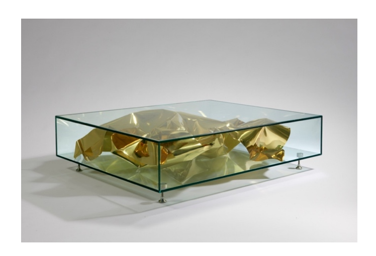
Fig. 6 Gold Crush Table, 2012 Edition of 8 + 2 AP + 2 P Glass, gold polished aluminum and stainless steel

51" L x 39" W x 13.5" H © Fredrikson Stallard