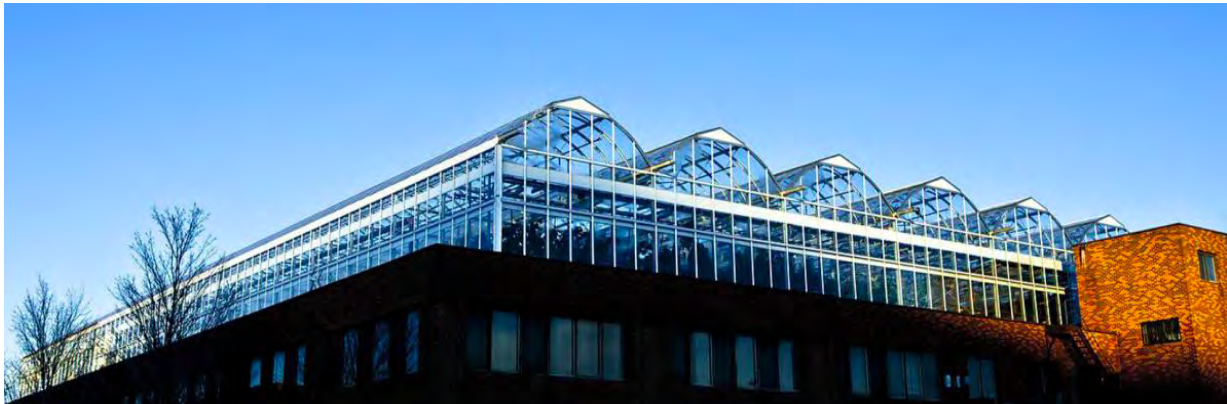
Fig 4: Photo 3 Rooftop farms – Lufafarms

“Urban and rooftop agriculture offers potential increased resilience in the food supply system while providing economic and environmental benefits including employment opportunities, a reduction of the heat island effect and energy reductions associated with the need for Air Conditioning (AC) to cool buildings in the heat of summer. Rooftop plants create shade reducing the solar heat gain of a building while providing additional cooling through evapotranspiration. Furthermore, local production requires shorter delivery distances reducing energy intensive shipping (including heating and cooling) reducing the overall GHG produced in the system by creating a less carbon-intensive alternative.” (Mitchell 2015)