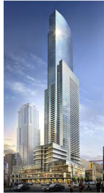
Fig 3: Photo 1, Aura Tower

“Rent and housing is the most pressing non-negotiable expense from which other necessities including food are sacrificed.”, www.dailyfood.ca