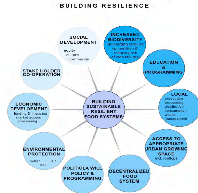
Fig. 5: The needs of a resilient local food system, Mitchell 2016

There is a need to look at mixed-use space that includes low, medium and high-density residential space and to include food access based on new methods of rooftop and vertical farming to increase access to affordable and nutritious, culturally appropriate food. Political will in terms of legislation and zoning changes would allow for the development of such spaces.