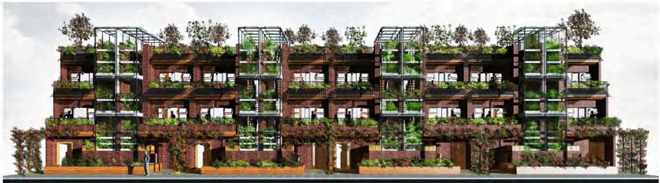
Fig 3: Photo 2 (BIA), Building Integrated Agriculture enabled terraced housing concept, www.architectureandfood.com

There is a need to look at low, medium and high-density residential space and mixed-use space that includes food access based on rooftop and vertical farming to increase access to affordable housing and nutritious, culturally appropriate food. Political will in terms of legislation and zoning changes would allow for the development of such spaces.