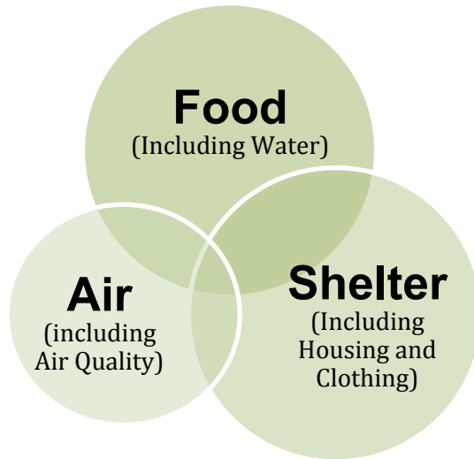
Fig. 2: Basic Necessities, Mitchel 2016

Along with exponential growth also comes the challenge to house the increased population. As more people migrate to cities to work, and to avoid costly transportation, the need for affordable housing will continue to increase creating additional stress on infrastructure, social services and the surrounding rural environment as the demand for resources exceeds availability. This demand for the dual provision of food and shelter quite often creates an economic dilemma for a family that sees the trade-off and sacrifice of food for housing. It is in this competition that the notion of an integrated system of food and housing becomes paramount.