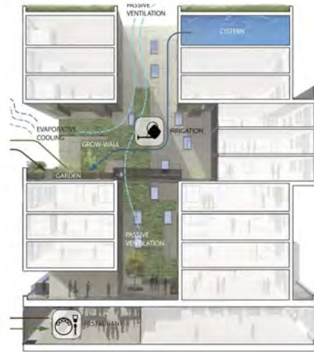
Fig. 7: Photo 6: 60 Richmond street Coop Building, Photo 7: Section showing Green roof & Growing Gardens

Like the “Second Suites” kick-start program (Toronto City Policy Planning & Research, Sept 2006) to increase legal rentable basements, policy development & guiding regulatory principles can be utilized to encourage more rentable basement, second and third floor housing flats, including small flats above in-garage alley locations. This same approach can also include the additional development of rooftop, vertical, and yard gardens to produce food. While these would require collective agreements and policy guidelines to preserve rental units, public laneways and to create connective social spaces to support cultural and social integration activities in the public domains, it could also foster a whole new culture of urban growing. This architecture of housing, both private and multiple dwellings needs to be redesigned to include these rooftop gardens, interior vertical gardens, and covered green house options. Accessible roofs, and growing supports like enclosures, plumbing and irrigation, and maintenance must be integrally designed.