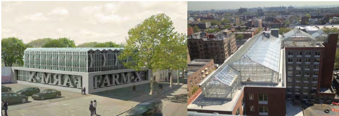
Fig. 6: Photo 4: Farm X Concept Production Building, Photo 5: Sky Vegetables Roof Greenhouse, NY

The Community Food Centres of Canada offers a new approach to providing healthy nutritious food for all opening a number of centres across Canada since 2012. Their mandate is to “enhance skills, create access to nourishment, advocate for food justice polices and build stronger, healthier communities.” According the Nick Saul, president and CEO of the Community Food Centres of Canada, “The public policy realm is where real change happens.” (The Globe and Mail, Wed Aug 10, 2016)