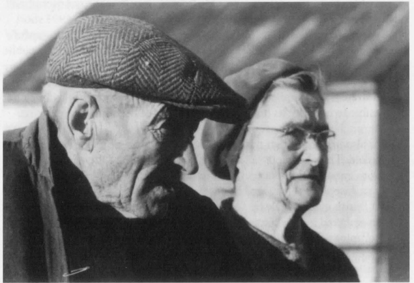
Still from 24 heures ou plus , Gilles Groulx, 1973, 16mm, 113 min.

One of the most revealing and original recent works to be produced in Quebec is Robert Morin's Yes Sir! Madame... , a feature length piece shot on film and distributed on video, which recombines inherited traditions of history, memory and imagination with contemporary constructions of autobiography, language, translation and performance. Yes Sir! Madame... reformulates the 50/50 national stalemate as an expression of the fundamental duality of the individual bilingual psyche, weaving a tale of explicitly subjective experience in the form of an autobiographical fable. A project almost twenty years in the making, Yes Sir! Madame... is constructed from footage filmed by Morin from the time he received his first Bolex