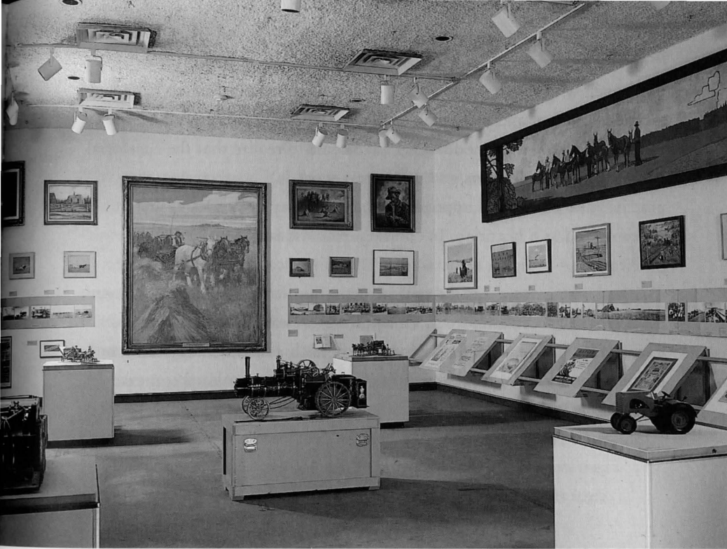
Work, Weather and the Grid: Agriculture in Saskatchewan , installation view, Dunlop Art Gallery

Both of these latter responses are rooted, I believe, in the French fascination with North American industrialization and urban space. It was personally very flattering (in my somewhat intellectually colonized ego) as Le Monde represents one of the highest international approbations in journalism. However, more significantly, it was rewarding that the history of representation held within and among the images, photographs, paintings and ads that others had created, but that I had researched, collected and organized, was able to speak so directly to a wide range of intellectual and historical sensibilities.