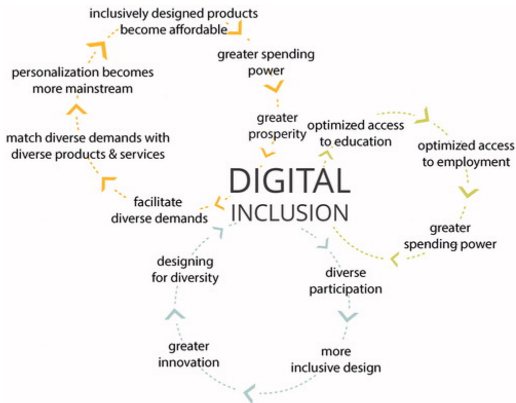
Figure 4. Virtuous cycles of digital inclusion from the IDRC. 12 The three rings illustrate the impact of greater access to and inclusive participation in the design process and the mutual effects of action at the level of the individual, society, and system.

At the edge or at the margins of any population there is far greater diversity. It can be said that the only common characteristic of disability, for example, is difference (Wang, 2015 Wang, M. [Director]. (2015). Inclusive [Motion Picture]. United States: Microsoft Design in partnership with Cinelan. Retrieved from www.inclusivethefilm.com ). Because the dominant trend is to design for the average, typical, or mass audience, this difference causes a mismatch between the needs of each individual and the design of the environment, product, or service, affecting the experience of disability. Our dominant designs similarly exclude other individuals in a minority, whether