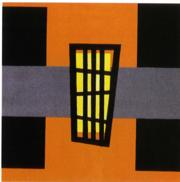
RIC EVANS Stored Memory 2003 Oil on canvas 61 x 61 cm

Visual deception and lyricism go hand in hand in the paintings. While their geometric shapes appear to reference natural forms, the painted shapes are tenuous and elude any precise recognition. Paint drips partially obscure the foregrounded lines of the compositions, setting up confusions between figure and ground. Painted pinstripes break up the surface. The compositions and use of colour play on symmetry so that the viewer is