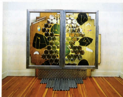
JERRY PETHICK Volklingen Scarab 1995 Aluminum, stainless steel, plywood, photographs, Fresnel lenses, glass, fluorescent fixture, SpectraFoil, silicon 2.45 x 2.1 x 1.35 m