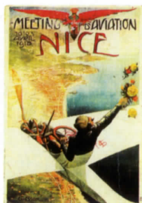
FLIGHT POSTER 1910. THE START OF EXTENDED FLIGHT AND JOURNEYS