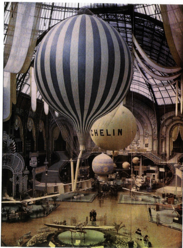
1909 AIR SHOW

Commenting on his latest work, Evans says, "It's not what you do, it's what you don't do that makes a painting interesting." His concern is for the observer to approach the paintings as objects, objects with unexpected and ironic compositional passages that then present an experiential confrontation. From that experience, he creates a discourse that is as sensual as it is intellectual. SARAH NIND