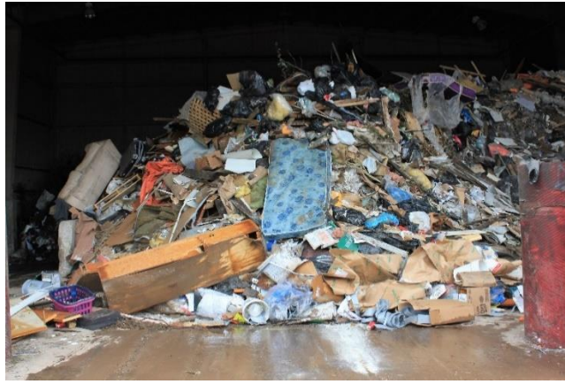
Figure 3: Hamilton City Dump (2016)

The camera served as a primary way to document critical information and my experiences at both sites. Photographs and video captured the ephemeral operations occurring at the sites, providing a method to reflect upon, understand and analyze the site, as well as to generate work to bring back to the gallery setting.