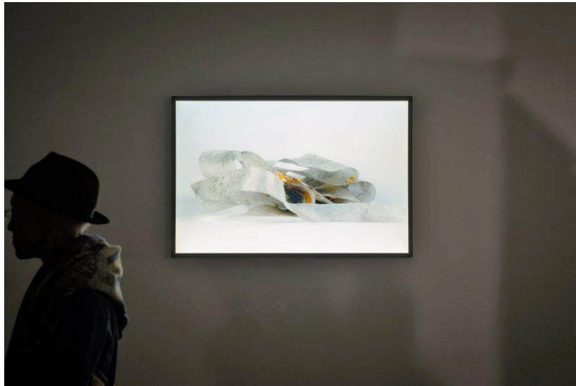
Figure 8: Final Exhibition, Not Enough Exposure II (2017)

Not Enough Exposure (2017) consists of two hyper-close, back-lit photographs of garbage. The images, of various sculpture form of a plastic found along the Hamilton Harbour shoreline, have been gold leaf gilded, emphasizing the folds and contours of the material. The dimensions of the two lightboxes 61cm (h) by 91cm (l), mounted at eye level, encourage the viewer to investigate the detailed information. Shot at high magnification, the hyper-visual image creates an abstract form, obscuring the nature of the material and opening a myriad of interpretations. The illuminated image immerses the viewer in a visual experience with the intent to expand the possibilities of the material.