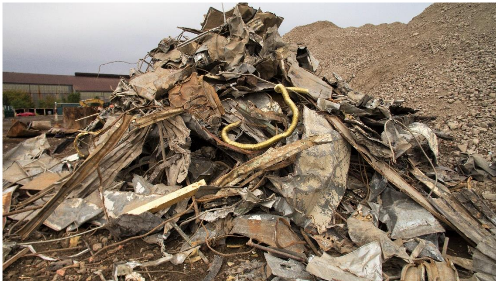
Figure 6: Still Photograph of Pile Mound from Treasure Scrap (2016).

Shot at a scrap metal site, Treasure Scrap (2016) consists of a slow-motion video of a large pile of discarded industrial waste. The camera moves languorously in and around the full range of the 3.5-metre-high pile. The meditative pace of the images give the affect of being underwater or in an otherworldly dimension. As the camera moves in closer, something unexpected occurs: alluring golden objects appear amongst the refuse. The ambience shifts from dread to surprise. The golden objects are also discarded material, except that they have been transformed by the application of gold leaf. The viewer’s curiosity is piqued by a sense of discovery. Progressively, the twelve-minute video patiently circulates among the objects and around the pile, contemplating information from this seemingly mundane arrangement.