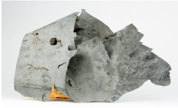
Figure 9: Not Enough Exposure I (2017)

would expect garbage to be. Instead, the painterly lines and aesthetic power impart qualities of significance and value. In this way, Not Enough Exposure aims to provoke contemplative consideration.