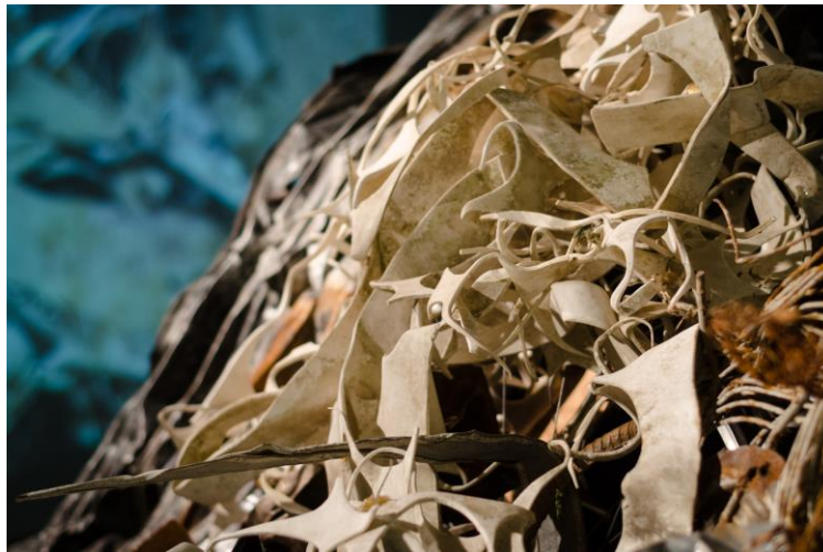
Figure 5: Monumental Trash (2107) Poetics of Trash Graduate Gallery Exhibition Show

in a chaotic form, the assemblage implies precariousness. Furthermore, the tactic of juxtaposing opposites such as high form and low material, permanence and ephemerality, creates ambiguity and intrigue. Yet, at the same time, these oppositional forces work in an egalitarian way neither prioritizing form over content or object over subject. As such, lines become blurred, binaries dismantled and traditional ontological frameworks contested. Monumental Trash aims to destabilize viewers and to challenge preconceived perceptions, even if for a few moments. A space is opened to reimagine and reconsider our relation to trash.