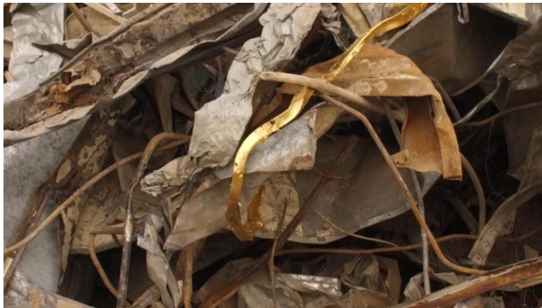
Figure 6: Still Photograph of Treasure Scrap (2016).

Tour , “video is as ephemeral as performance. But a pre-recorded tape aspires to the condition of permanence ... [it] represents a moment of history frozen in the aspic of the oxide coating on the surface of the tape” (2005:14). Filming one of Ronaldo’s monumental piles with Laura’s camera work and my direction, along with slo-mo Osmo video camera, crystallized the expressive power of the pile and allowed its brief performance to be brought into the gallery setting.