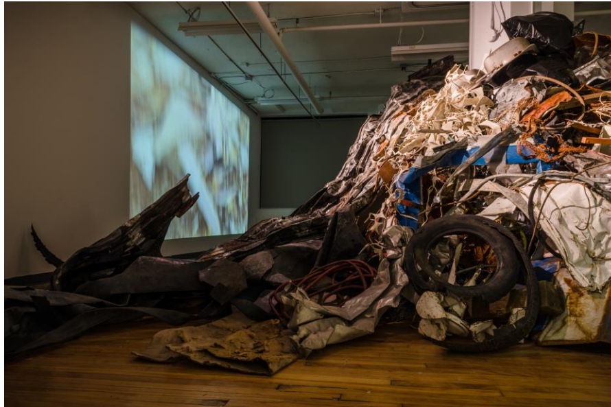
Figure 4: Monumental Trash (2017) Poetics of Trash Graduate Gallery Exhibition Show

Monumental Trash (2017) consumes nearly half of the Graduate Gallery space. Truckloads of discarded materials – metals, plastics, wood, styrofoam, cords, wire, rebars, pails, building materials and bags of garbage – were brought to the gallery from Hamilton. The arrangement, in part, mimics the in-situ piles of discard waste at the scrap metal and city dump. A spotlight further dramatizes the pile as well as casting a large shadow on the adjacent wall, contrasting volume and solidity with ethereality. The imposing sculpture extends out onto the gallery floor, compromising the visitor's movement, who must then squeeze along the edge of the garbage and gallery wall before reaching the rest of the exhibit.