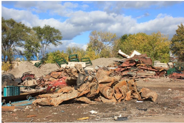
Figure 2 Scrap Metal Site (2016)

While involving vastly different methods, materials and practices of meaning-making, site-specificity embraces two distinct features – place and ephemerality (Kaye 2000). Site-specific artists such as Andy Goldsworthy, Nancy Holt and Helen and Newton Harrison situate their practice in “place,” spending prolonged periods of time exploring the chosen site, drawing from site materials, producing artworks solely on site and/or producing artworks at non-site locations (Kastner & Wallis 2010). Some works last no more than a day while others such as Joseph Beuys’ 7000 Oaks (1982), a work that heightens time and ephemerality, last for decades (Kastner & Wallis 2010).