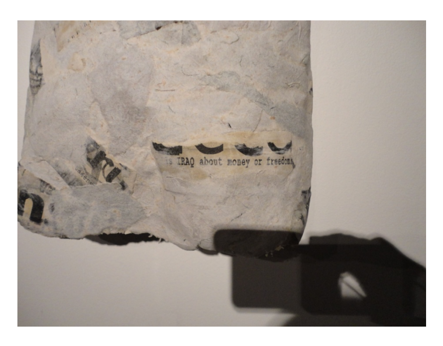
Figure 8. Robynn Murray, (detail) Healing, mixed media 11 1/4" x 17 1/2" x 4". Date unknown.