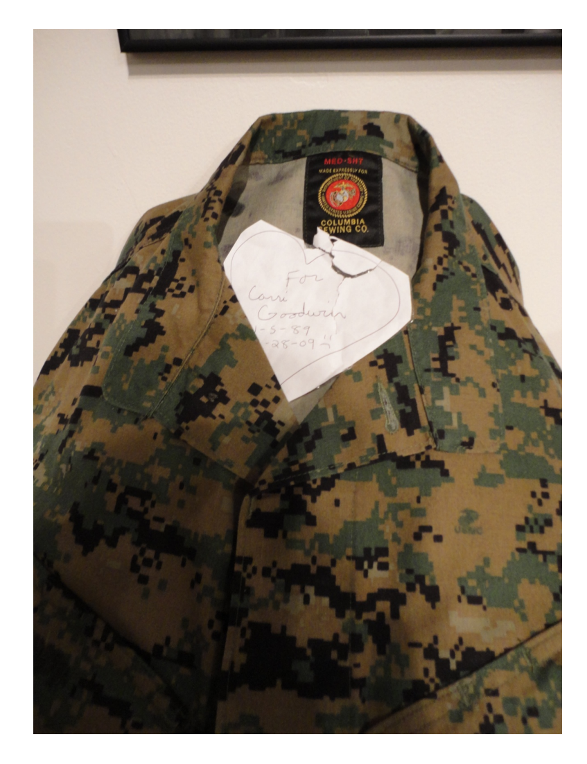
Figure 12. Carri Goodwin's Military Uniform.