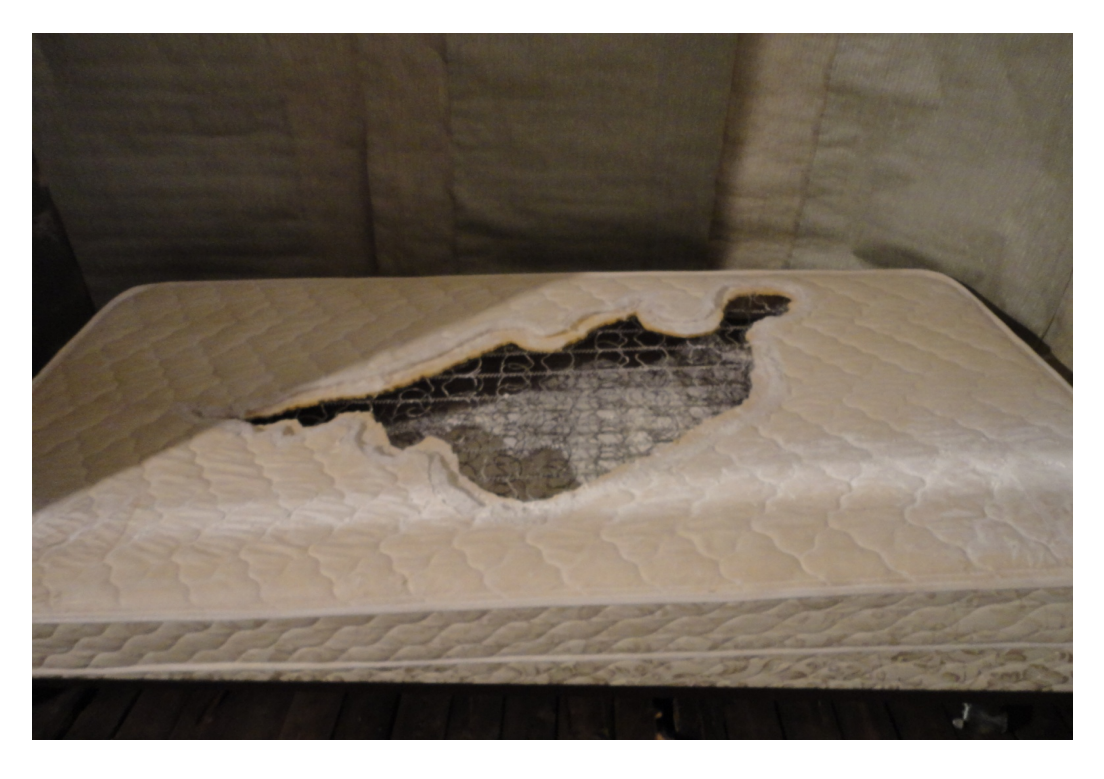
Figure 11. (Detail) Erica Slone, Uncovering My Crime Scene , 2011, mixed media.