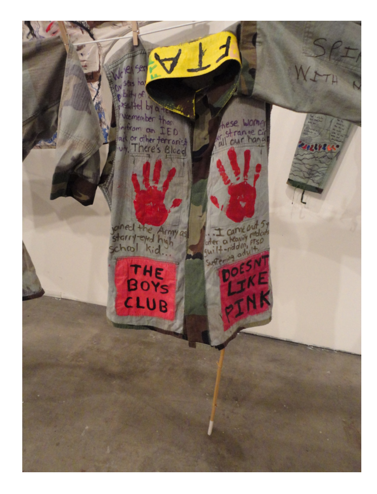
Figure 10. Anonymous, Fatigues Clothesline , 2012, mixed media.