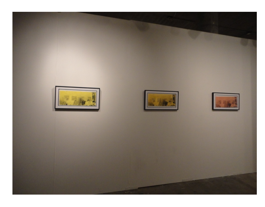
Figure 4. Victoria Robillard Bryers, And the Towers Fell (1, 2, & 3), lithography/intaglio/monotype on paper, 22" x 9" (each). Date unknown.