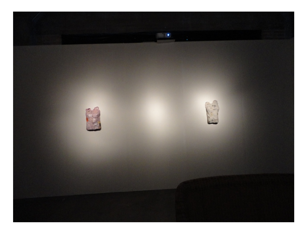
Figure 7. Robynn Murray, In doctrination , mixed media 12" x 17 1/2" x 4"; Baghdad , mixed media 12 1/4" x 18" x 4 1/4"; Healing , mixed media 11 1/4" x 17 1/2" x 4". Dates unknown.