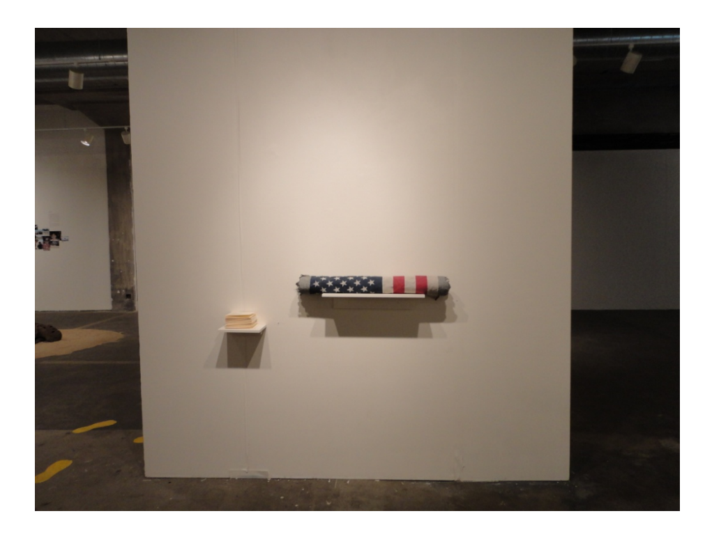
Figure 6. Maggie Martin, Title Unknown , mixed media 32 1/2" x 4 1/2" x 4 3/4". Date unknown.