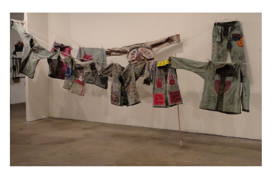
Figure 5. Fatigues Clothesline , 2012, mixed media. Image courtesy of the author with permission to use from the National Veterans Art Museum.