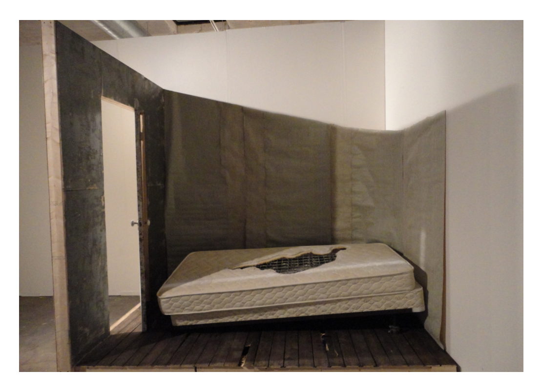
Figure 9. Erica Slone, Uncovering My Crime Scene , 2011, mixed media.