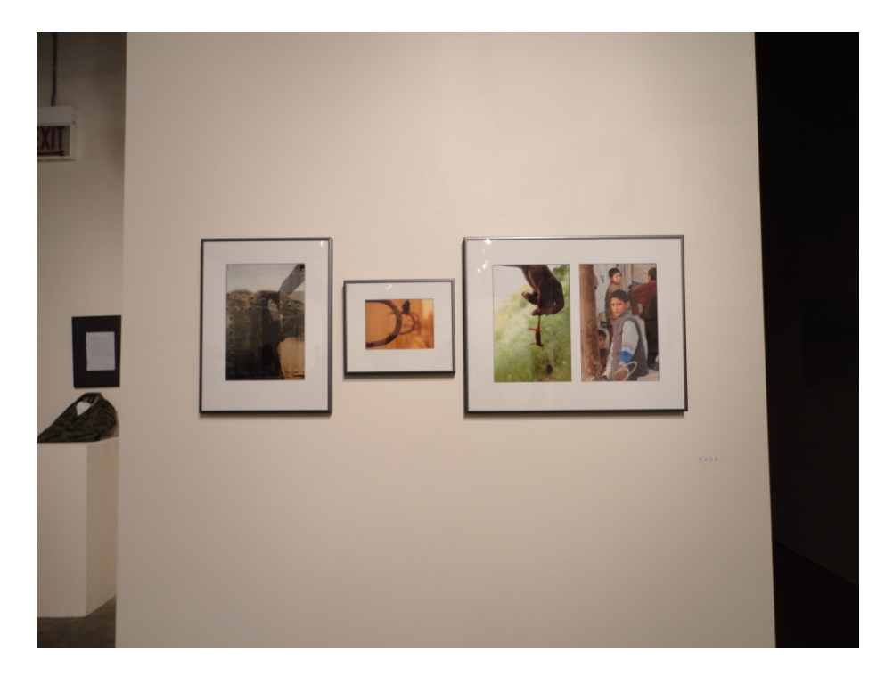
Figure 3. Emily Yates, (from left to right) Self Portrait in Black Hawk , glossy print photograph 12" x 16", Tent City Rebar , glossy print photograph10 1/4" x 8 3/4", Stop Loss , glossy print photograph 20 1/4" x 16 1/4", The Skeptic , glossy print photograph 20 1/4" x 16 1/4". Date unknown.