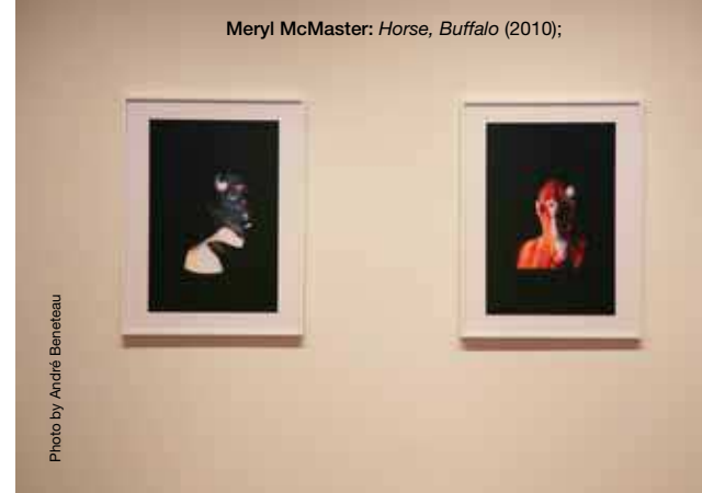
Meryl McMaster: Horse, Buffalo (2010);