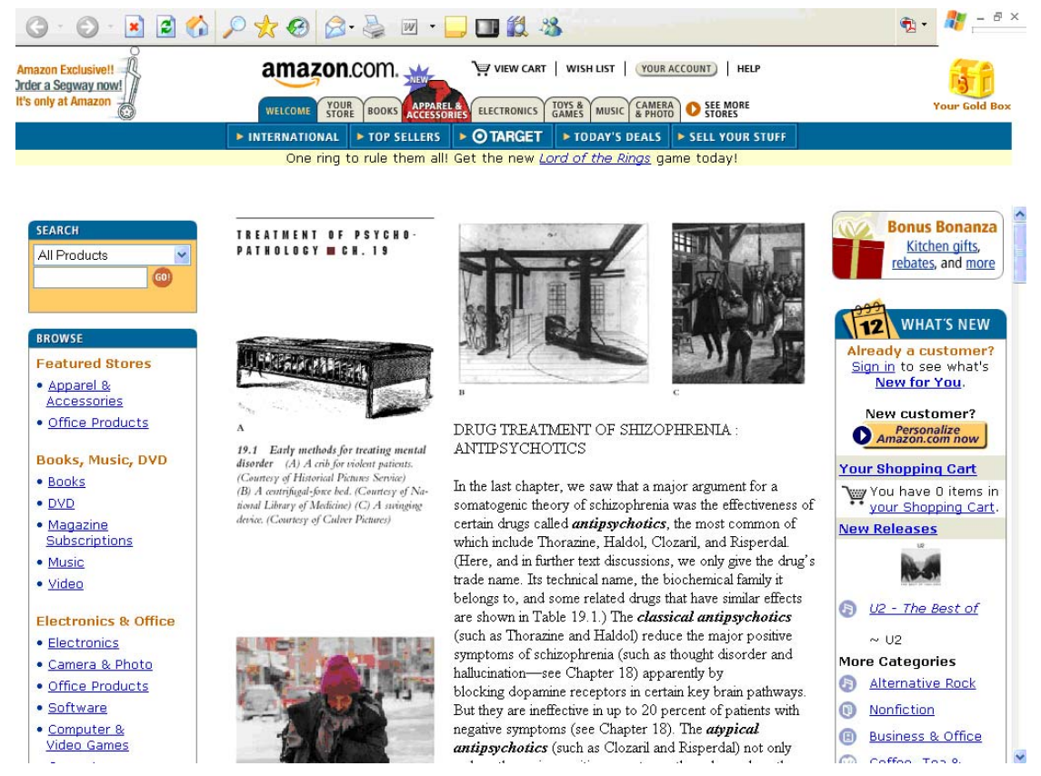
Figure 2: Stimulus-rich (noisy) environment; Amazon condition

Finally, all participants were given up to 15 minutes to complete a short pencil-and-paper multiple-choice test of 15 questions related to the material that they read and learned online.