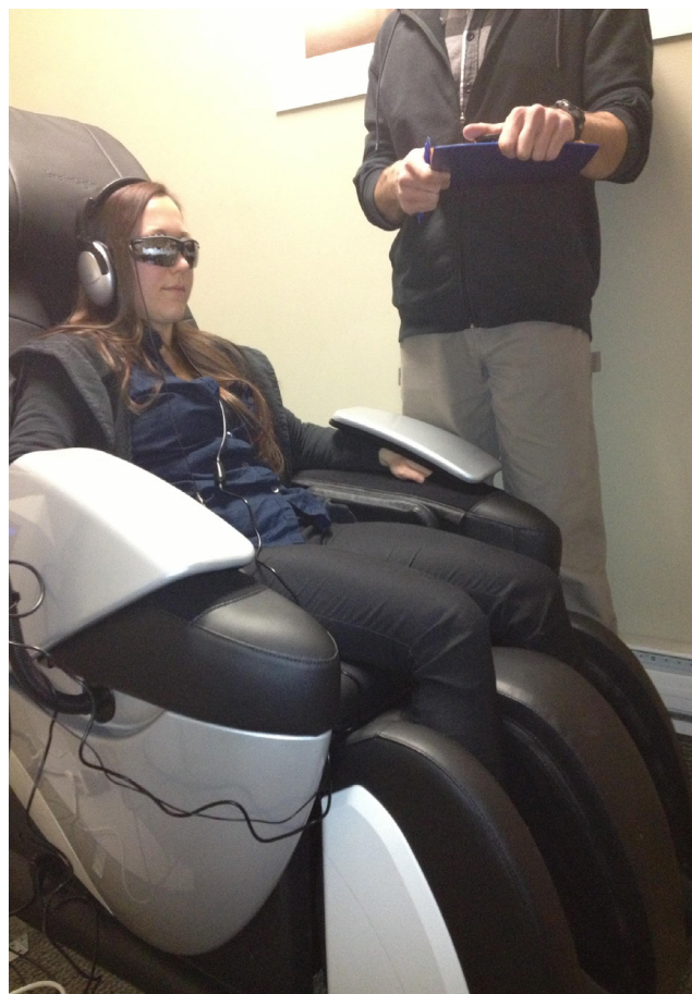
Figure 1. Medically supervised TEMM therapy

neurobiological process of dreaming, [12] and in Csikszentmihalyi’s flow model of highly memorable and meaningful peak states, using immersive simulated environments to approximate the best experiences of people’s lives.