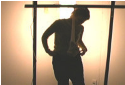
Figure 2: Emphasizing robot-fetus connection

Overall, the visual design of the project was effective, and quite close to how I had envisioned the installation. This was particularly important as it was important to make the visual connection with Geddes' photographed babies. The nylon environment, though delicate to work with, reinforced the union between a technology (in this case the chemical technology of nylon) and women's everyday experience (the nylon stocking being, for the most part, a uniquely female wardrobe item.) The relative fragility of the robot structure also provided a nice parallel to the infant model.