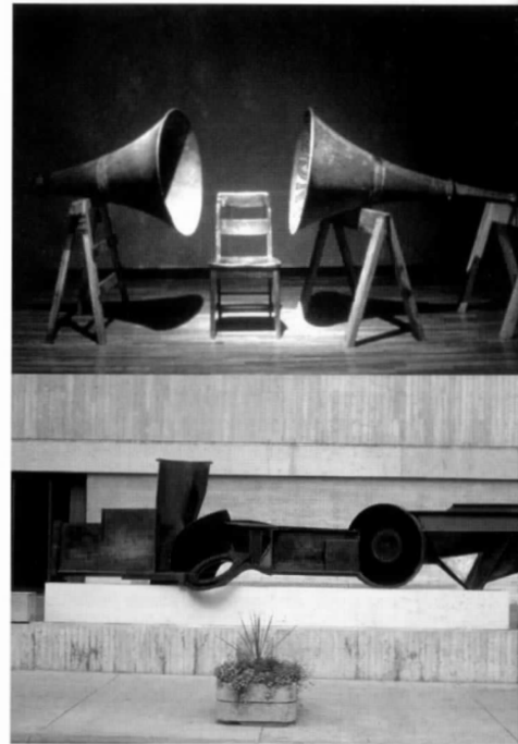
Clockwise from top: Janet Cardiff & Georges Bures Miller, The Dark Pool (1995), multi-media installation, photo courtesy Edmonton Art Gallery / Peter Hide, Malevitch Extended (1992–96), steel, 203.2 x 823 x 129.5 cm, photo courtesy Glenbow / Margaret May, Surrender from Voice Series (1995), lithograph on plaster, burlap and MDF backing, 73.7 x 50.8 cm, photo courtesy Edmonton Art Gallery