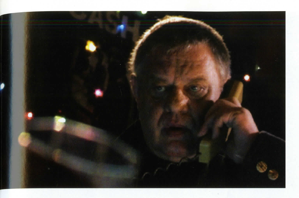
LEFT AND OPPOSITE: Janet Cardiff and George Bures Miller Video stills from The Paradise Institute 2001