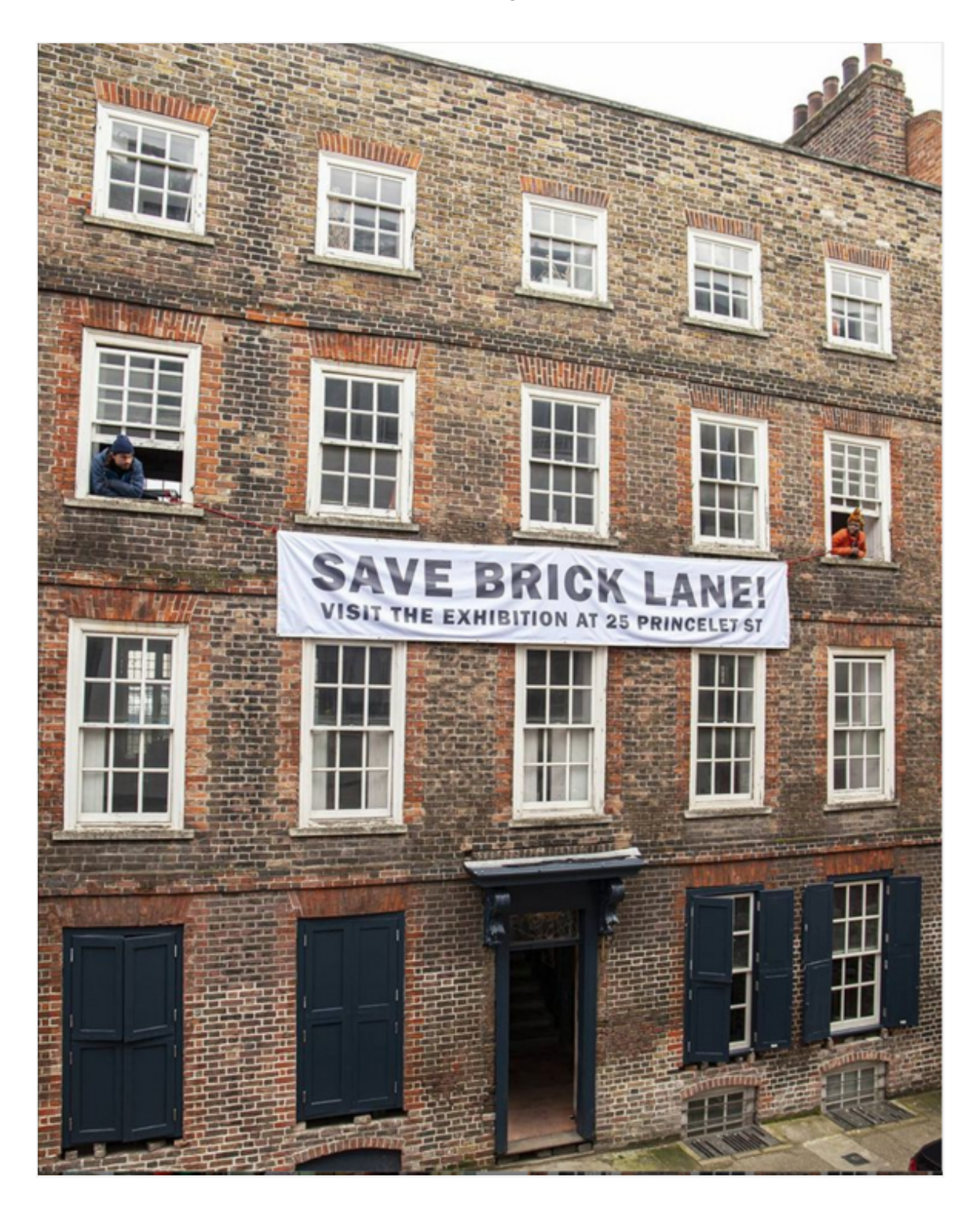
Figure 2. Princelet Street 25, source: <a href="https://houseofannetta.org/">https://houseofannetta.org/</a>.