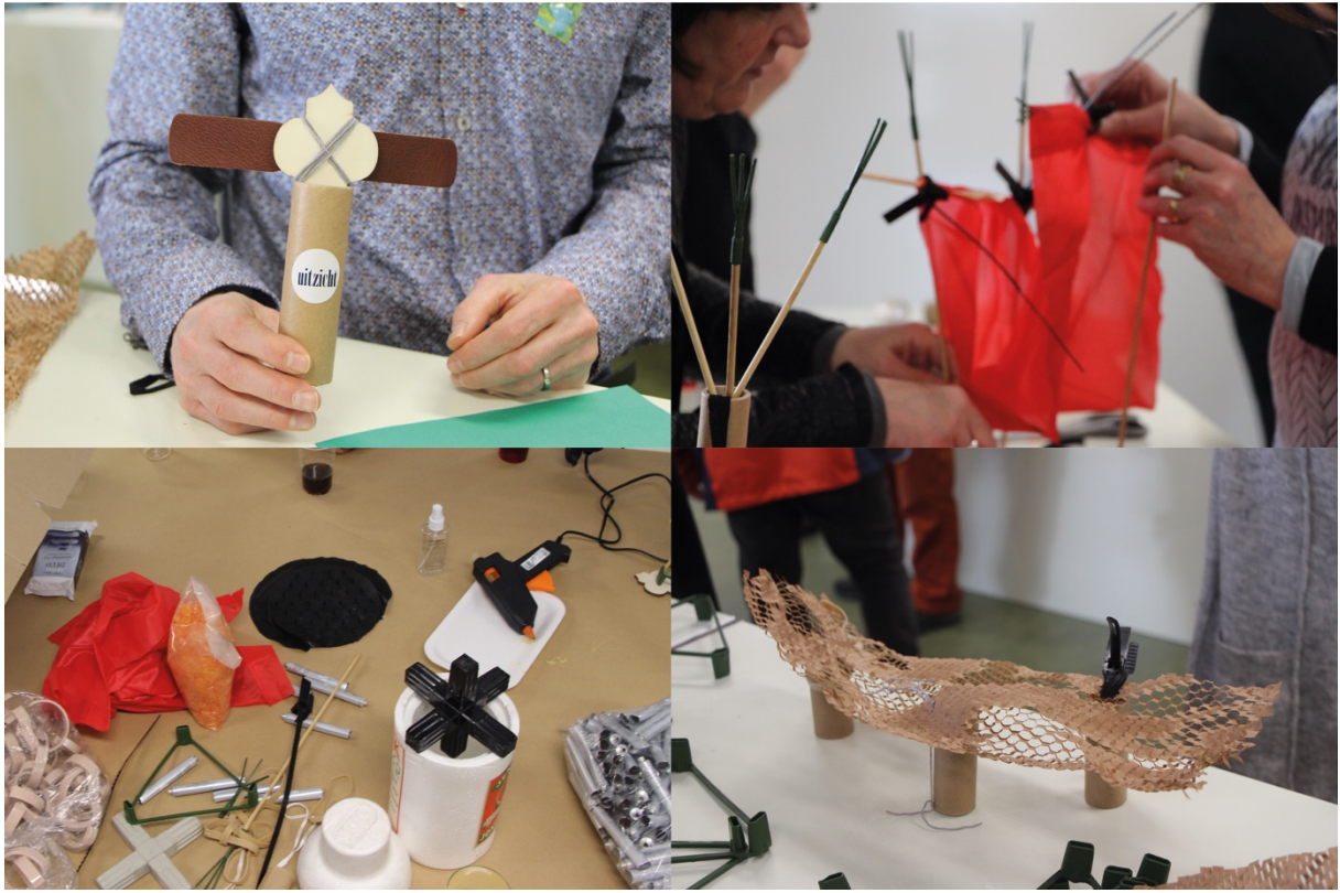
fig 2. Building probes with brown paper and scrap materials

Then the participants (or teams of participants) are asked to develop a concept about the future over a time frame of 30 years (2050). Next step is to visualize and build that future in a tangible 'probe' (see fig. 2). Following, we will have a dialogue to share the probes of each participant(-team) and the story behind, and ask each other clarifying and deepening questions.