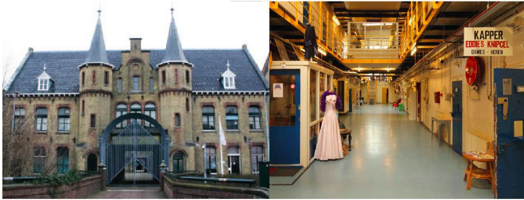
Figure 2. Blokhuispoort exterior and interior, www.blokhuispoort.nl , 2014