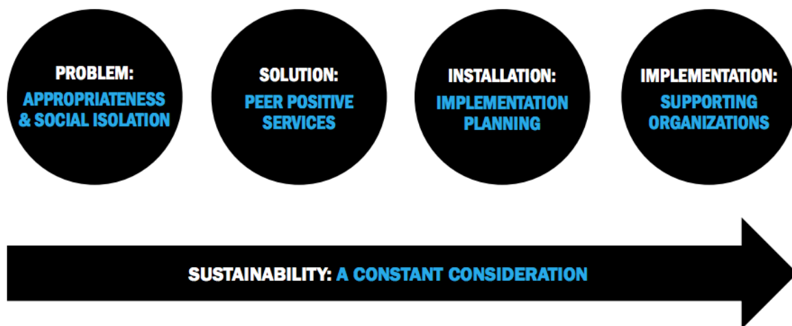
Figure 2: Overview of the NWT SC Process

Figure 2 depicts the process followed by the NWT SC from problem identification to implementation.