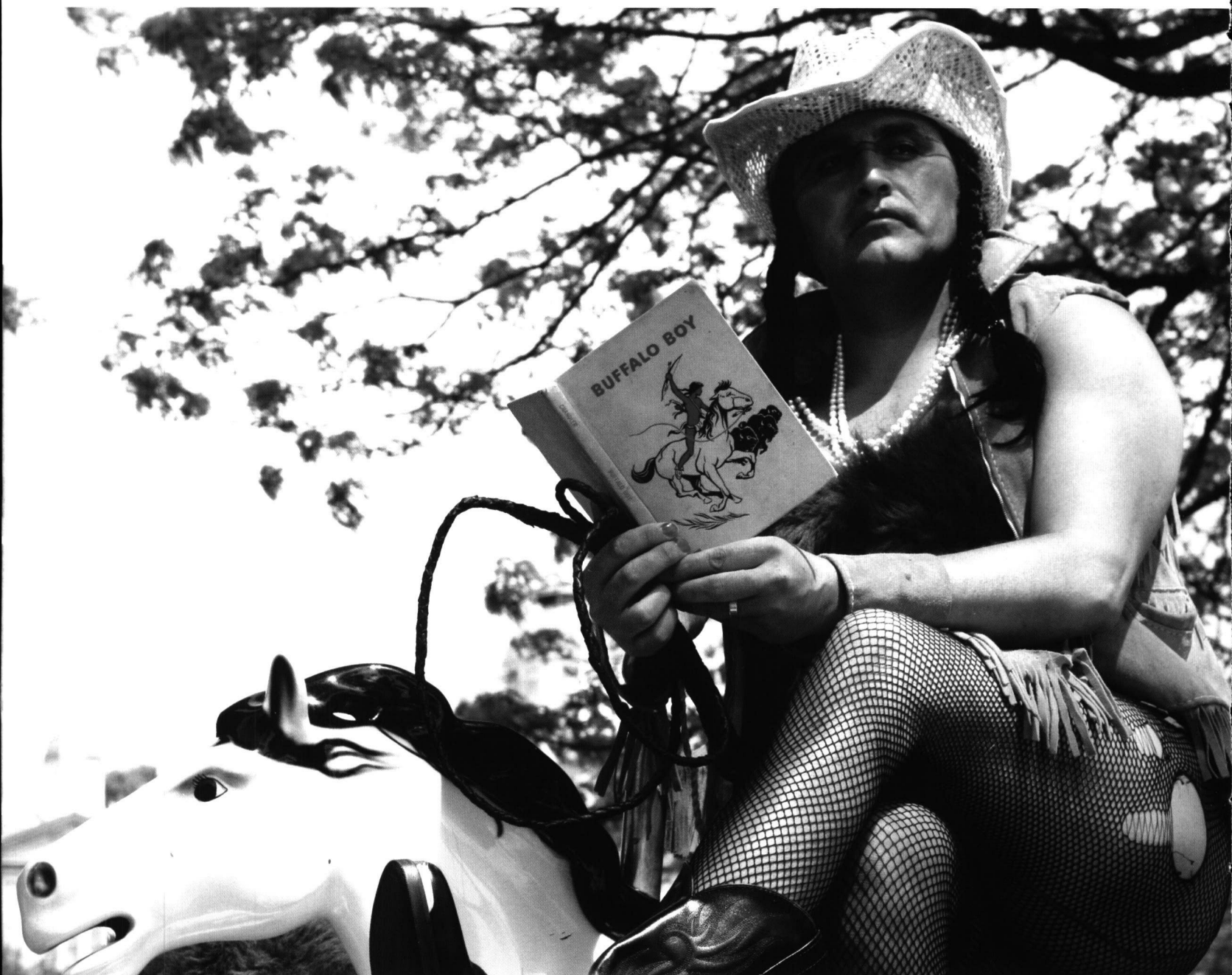
Adrian Stimson. Buffalo Boy: Do Not Feel the Buffalo , 2008. <opposite page> Adrian Stimson. The Battle of Little Big Horn , 2008.