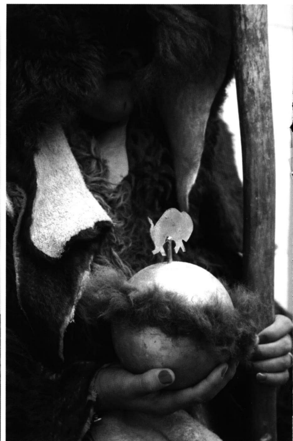
<left> Adrian Stimson. The Battle of Little Big Horn — Topping Old Sun , 2008. <right> Adrian Stimson. The Battle of Little Big Horn , 2008.