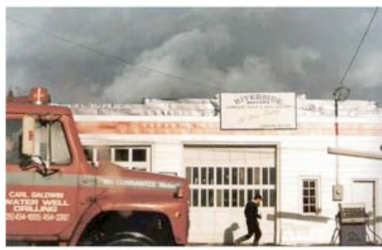
Jean Baudrillard "Toronto" (1994).

Such an overt lack of contextualizing factors, both in terms of the limited visual information contained within the images themselves and the use of base factual and non-conceptual titles, limits the level of engagement possible with the photographs. The image becomes a self-contained and impenetrable vision of a world submerged in the hyperreal. The reality or unreality of these photographically contained worlds are in this way made inaccessible; the only way to "exit from the crisis of representation, the real must be sealed off in a pure repetition". 22 And this is precisely what I believe Baudrillard does: he seals off the subject within the pure repetition or reproducibility of the objective representational capacities of the photograph. The photographic image that he captured in "Toronto" (1994) presents an objective model onto which viewers can graft their own conceptual vision of this scene – a man walking in front of an old gas station.