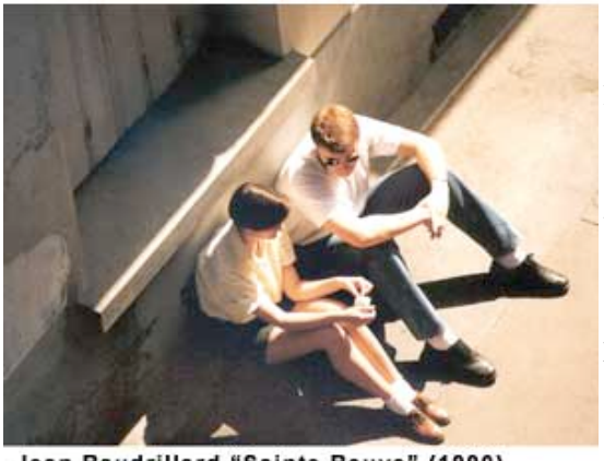
Jean Baudrillard "Sainte Beuve" (1990).

an act of transubstantiation are available through photography. Baudrillard uses the photograph – which is capable of being reproduced infinitely because it is based upon the model and not an original – to not only fabricate his disappearance into the image, but also to present this disappearance as a hyperreal document. As he states in an interview with Catherine Francblin: "At a given moment, I capture a light, a colour disconnected from the rest of the world. I myself am only an absence in them". It is this magical disconnect from reality that photography enables which is of interest to Baudrillard. Considering "Sainte Beuve" (1987) as a hyperreal self-portrait of Baudrillard's subjective disappearance, I believe that the medium of photography represents a hyper utopian vision of the Baudrillardian subject that disappears into the object of its own image. For Baudrillard, who no longer believes "in the subversive value of words", the photographic image represents the means of achieving his theoretical ambitions of disappearing as a subject and reappearing as an object. This utopian ambition is both theoretically and technically present in the hyperreal surface offered by the photographic model. Baudrillard's relationship to the hyperreal may be more complex than we (he?) have previously surmised!