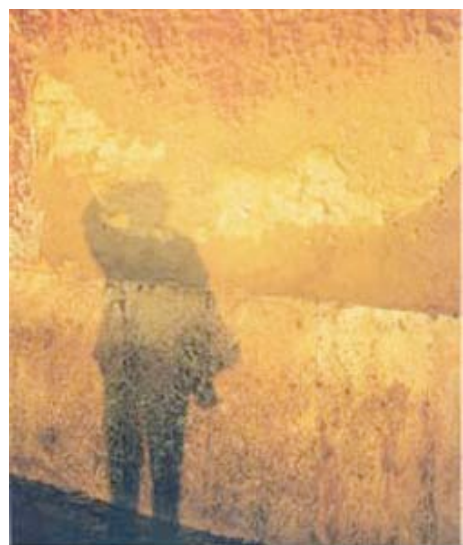
Jean Baudrillard "Punto Final" (1997).

The photograph as an object becomes an embodiment of a reproducible or serial subjectivity, in much the same way that Walter Benjamin speculates in "The Work of Art in the Age of Mechanical Reproduction" – specifically regarding the loss of a unique history or context, what he terms the work's aura , which results in an inherent lack of originality. Baudrillard adopts and employs Benjamin's ideas on this subject in his essay "Clone Story", in which he states: