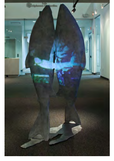
Figure 2. Vulnerable: The Salmon Project. Cast aluminium sculpture rear view with film projection

projected on the cast aluminium standing salmon sculpture installation work (see Figure 2). The film subject proposing an historical family documentary on salmon fishing in the Gaspe Peninsula from the 1940s brings to the work, the concept of memory. The artist's family heritage becomes a metaphor for the declining condition of the salmon population, and the expression of the vulnerability of today's marine life. Through image mapping of a referential past on one side of the cast aluminium standing salmon sculpture form, whereby means of extruded letters on the other side, the viewer can read the text "Vulnerable"