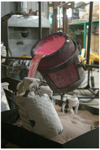
Figure 7. Aluminium pour of the salmon project

In sculpture practice, while the digitized object regains physicality through rapid prototyping technology, transformative analogue processes such as mould-making and metal casting (see Figure 7) are used to bring permanence to the sculptural object (see Figure 8).