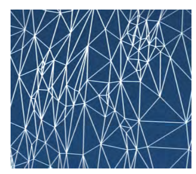
Figure 3. Polygon mesh. Close up view of vectorized Salmon sculpture 3D scan file

By means of the sculpture installation work addressed in this paper, digitizing processes have been utilised where the sculptural object is vectorized (see Figure 3) or represented as a series of points positioned in space and in relation to one another on an XYZ axis.