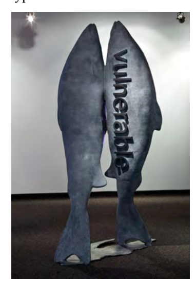
Figure 1. Vulnerable: The Salmon Project.

The sculpture installation work, titled Vulnerable: The Salmon Project (see Figure 1), conveys an hypermodern worldview which refers directly to the film narrative