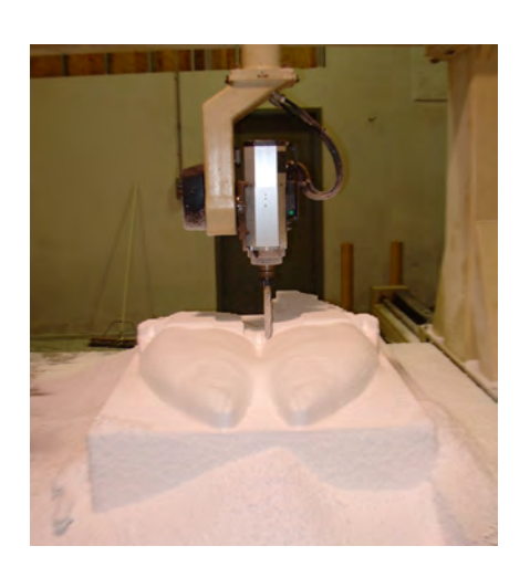
Figure 6. CNC routing. Styrofoam Salmon sculpture form

When familiar with the technological environment and interacting with a data medium, artists' spontaneity becomes linked to the concept of the "here and now" conveyed by