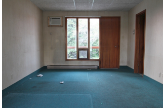
Beach Motel rm #31, 2011 Oliver Pauk c-print 12'x18'

The unfinished, dashed-off, and seemingly empty works in Everything and Nothing obviously exist in a very different time and place than Manet's 19th-century Paris, both in relation to technology and the history of painting. As much as they might share with the historical avant-garde an acceptance of the limits of figuration, they exist in an environment where the image has never been treated more casually. Whereas Manet's paintings may have been half-finished, these works remain suspended somewhere between a beginning and an absolutely indefinite end. After the Internet, every image is unfinished. A provisional painting, a remixed video, or the photograph of an abandoned motel room are entirely appropriate when the landscape is virtual and ephemeral, refreshing itself faster than a multitude of screens can ever keep track of, and certainly faster than any painter, or even photographer, can ever hope to account for. Is it any surprise then that these works highlight the "tentative, unfinished or self-cancelling"?