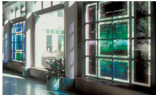
Figure 3 “Eight Tone Poems”

The most recent project is not a pre-existing building, but a house/studio (Reid and Balabanoff) designed specifically to include a south facing ‘aperture’ and interior ‘projection wall’ 6 . The building is conceptually related to the sun’s pathway, and the colour/light intervention draws attention to this important aspect of the architecture, while it relates to the surrounding environment and its colour palette.