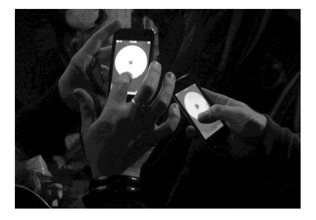
Figure 2: Tentacles iPhone interface & users.

Our hope was, through interaction, the experience would inspire a kind of spontaneous public performance. Operating from within the crowd, viewers had the opportunity to 'step onto the stage' of the projected environment – to display themselves in action, engaged with other virtual creatures. Text messages within the system, for example, are not sent to each other's private, small screen view, but rather are posted to your public, large screen self. Similarly, the way that movements, gestures and displays become part of this spontaneous public performance is suggestive of the activity on a dance floor, where typical rules about decorum, reservation, engagement with strangers and physical contact are suspended. A private, gestural experience is amplified publicly as a by-product of being within a crowd, as opposed to being a self-conscious performance staged for the benefit of the viewer. Here, in Tentacles, the differentiation between viewer and participant is effaced.