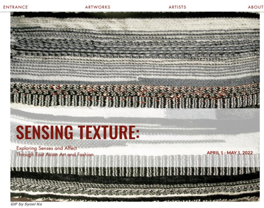
Figure 1. Sensing Texture - Online Exhibition - Entrance