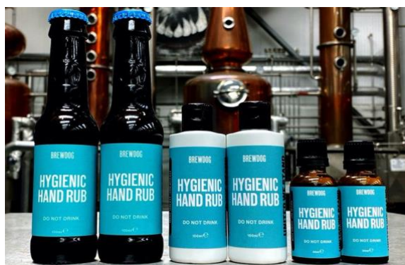
Figure 2: BrewDog's beer bottle hand sanitiser packaging.

Great Britain) and also small local distilleries did the same. In these cases, part of the production has been devolved free of charge to the Civil Protection, partly for sale, in small quantities, to make up for supply difficulties in supermarkets.