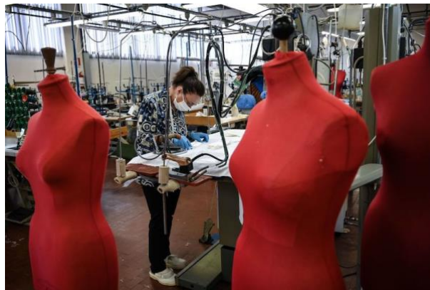
Figure 1: A Worker Irons Masks in the Atelier Miroglio Headquarters in Cuneo, Italy.

The need for surgical masks has been met by fashion companies, which have used their implants to produce non-woven fabrics (TNT) and so-called community masks. Companies like Armani, Bulgari, Prada, Miroglio, Calzedonia, H&M started running their plants to produce scrubs and masks with TNT supplied by other companies. Companies that produce sportswear, like Santini, have used their technical fabric to produce washable and reusable masks. Even when the plant could not open, the seamstresses of Scervino, from Florence, sewed masks and scrubs from home with the fabrics that the company had bought on purpose.