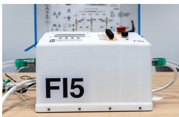
Figure 3: FI Ventilator by Ferrari.

The final analysed product is slightly different from the two previous ones, as it is not a common good. However, it is intended for hospitals and first aid: mechanical lung ventilator. It is a mechanical ventilation machine to help patients with respiratory failure, one of the most severe COVID-19 symptoms. The ever-increasing demand for lung mechanical ventilators due to the high number of patients with respiratory failure has led to the use of a single ventilator for multiple patients (multiplex ventilation). However, studies have confirmed several risks (Chatburn et al., 2020). Therefore, firms with high technological content, especially in the automotive sector, converted their plants to produce lung mechanical ventilators. Big companies like Lamborghini, FCA, Mercedes, Ferrari, General Motors, Ford, Tesla started to produce ventilators, like Ferrari's FI5 fan, which can be mass-produced using materials that are easy to find. Manufactured ventilators have a much lower cost than ventilators currently available on the market. Other non-automotive companies contributed, too, like NASA, Belkin, Fitbit.