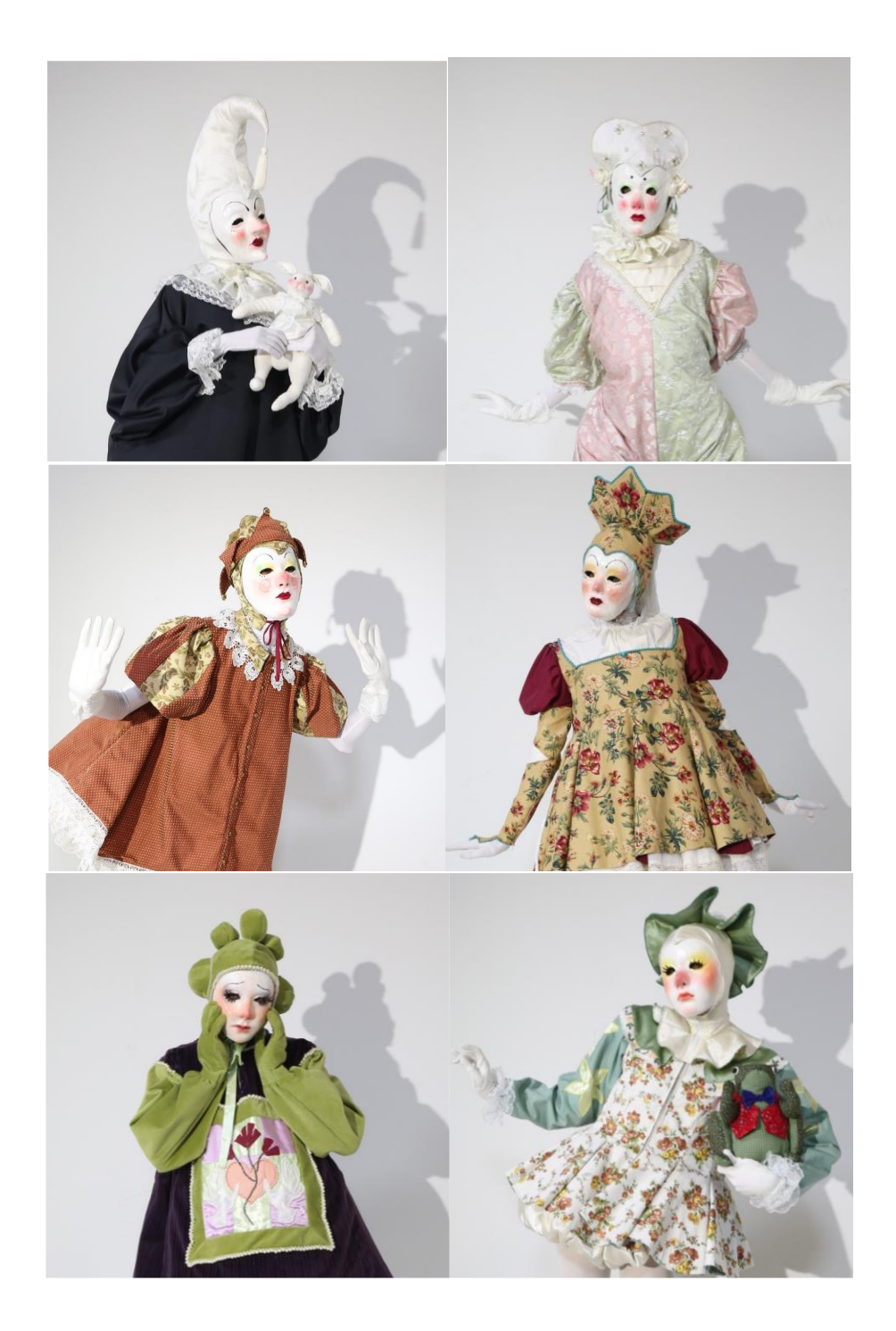
Figure 1: Pierrot Characters. 2021.