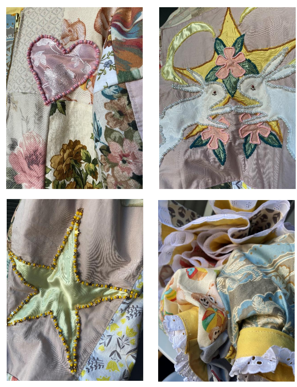
Figure 8: Pastiche Costume Details. 2022.