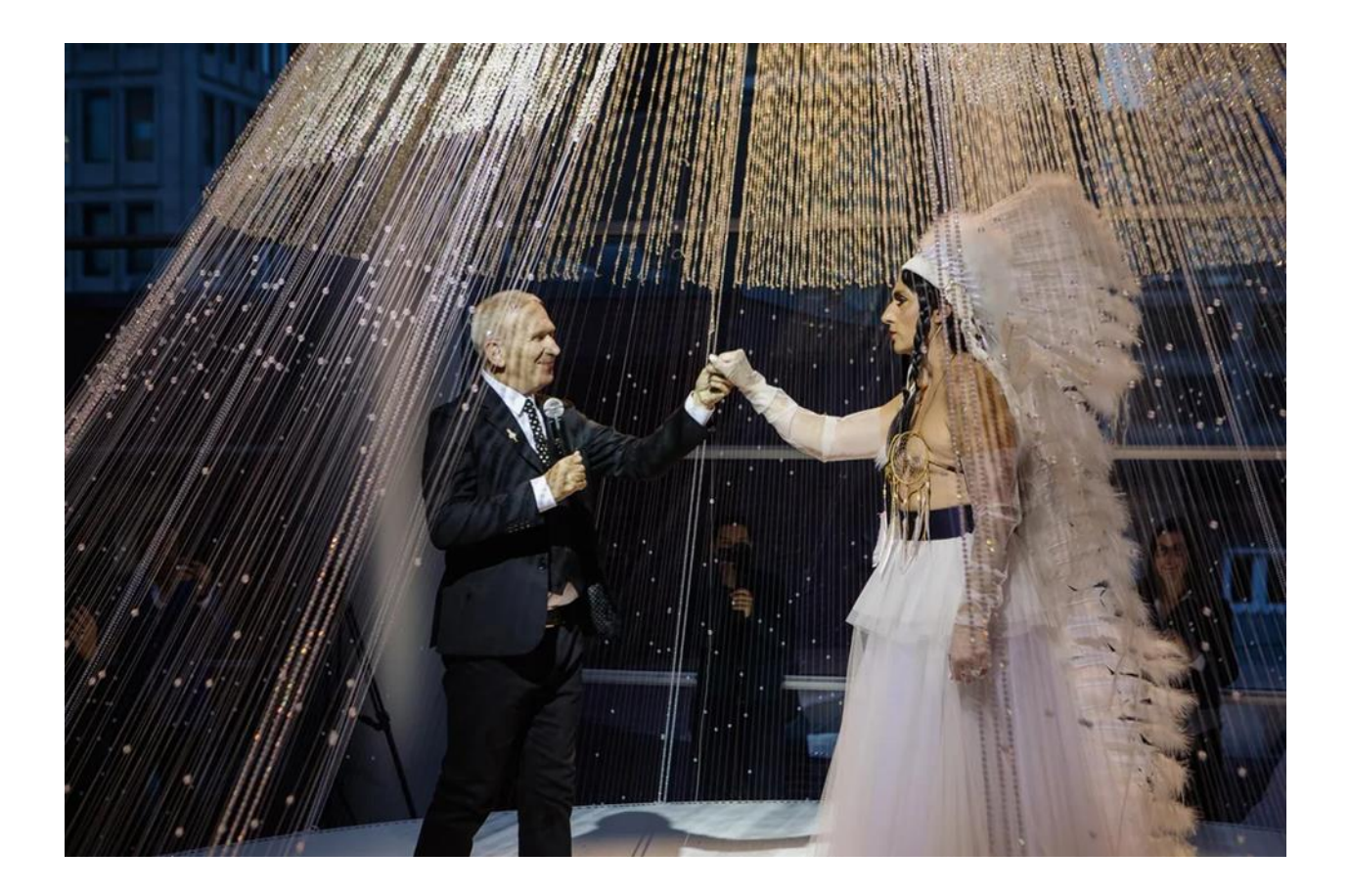
Figure 5: Jean Paul Gaultier and Miss Chief Eagle Testickle (Kent Monkman), Montreal Museum of Fine Arts, September 8, 2017. Photo: Frédéric Faddoul.

Retrieved: March 14, 2022. <u>https://www.mbam.qc.ca/en/news/kent-monkmans-another-aeather-in-her-bonnet/</u>