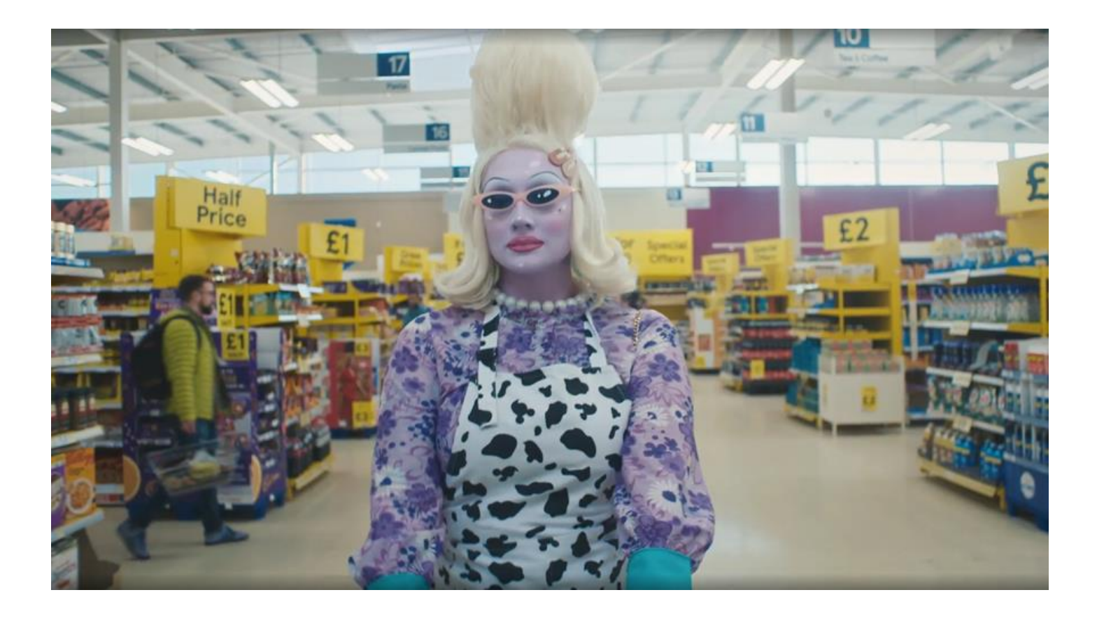
Figure 2: Juno Birch at grocery store. Vogue "Juno Birch Breaks Down Her Alien Queen beauty Routine". September 5, 2019.

Accessed March 14, 2022. https://www.vogue.com/video/watch/juno-birch-alien-queen-extreme-beauty-routine-video