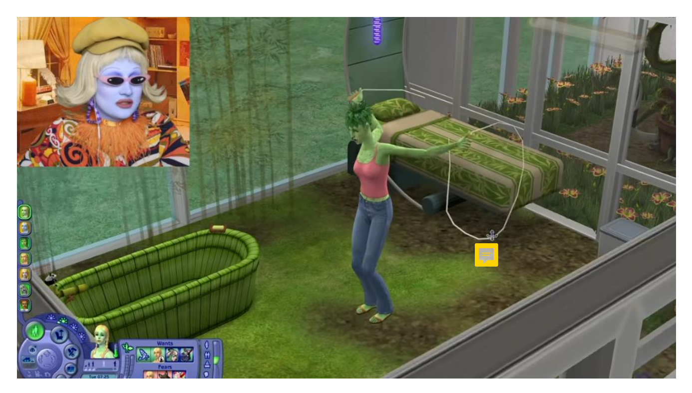
Figure 3: Juno Birch playing The Sims 2. September 7, 2021.

Retrieved March 14, 2022. <u>https://www.youtube.com/watch?v=qFn891a4CMk&list=PLP915YulD0rNX7iCUj3bg48kCW4TvkDrv&ind</u> <u>ex=2</u>