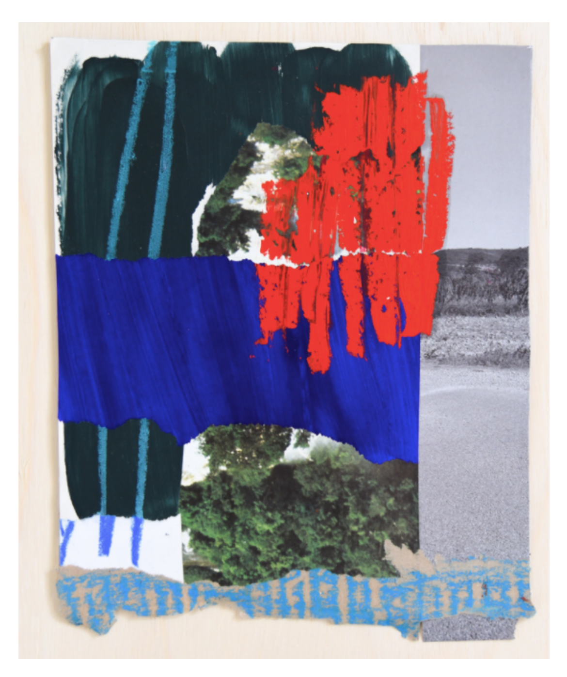
Jasmine Cardenas, Untitled 2 (2016)