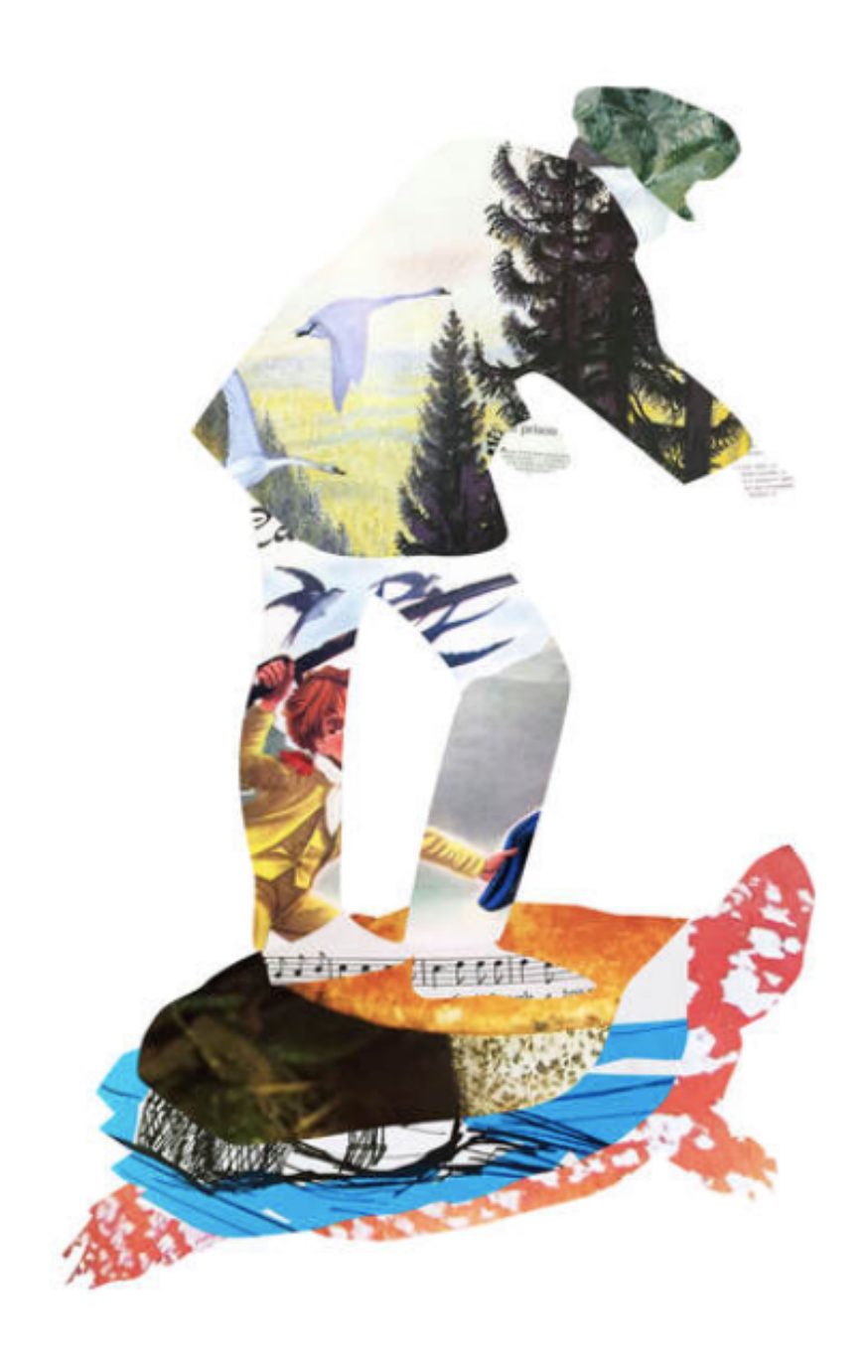
Anna Binta Diallo, Flight or Fight with Tortoise (III) (2020)