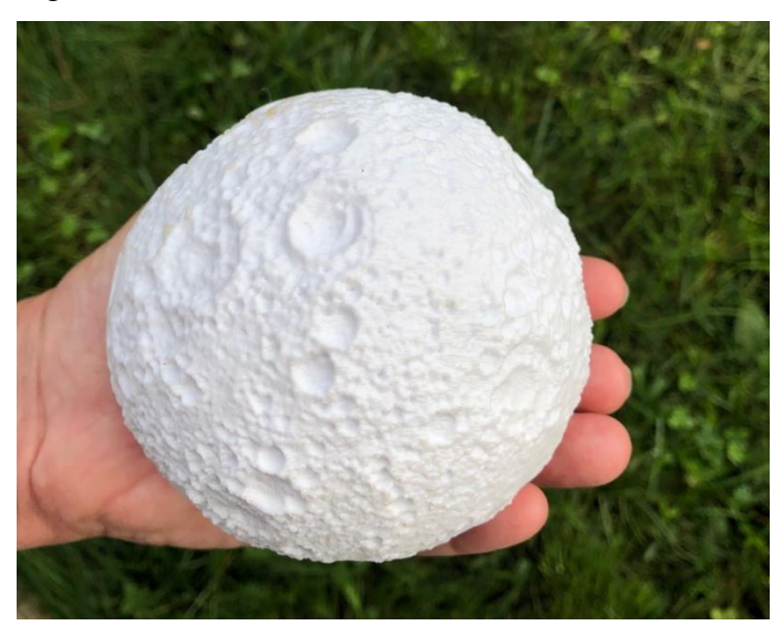
Figure 3: 3D Printed Moon Surface

I found a moon model, in the stereolithography file format, I.E. with the file extension, stl, which can be printed by most 3D printers. The model was programmatically generated by a Wikipedia user, based on laser altimeter data collected by NASA's Lunar Reconnaissance Orbiter space craft (User: Cmglee, 2020). It exaggerates real elevations by a factor of ten, to accentuate the moon's surface features.