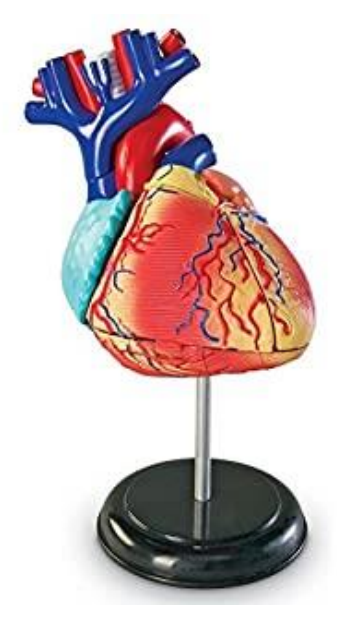
Figure 4: Walter Products Heart Model

The model, when it arrived, was a shock to me. I have read descriptions of hearts in textbooks, and received "heart-shaped" cards on Valentine's day; from those experiences, I had formed a mental model of what the human heart is shaped like. It was nothing like the shape of this actual model.