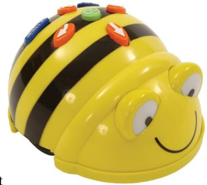
Figure 1: Bee-Bot

Kabátová et al. (2012) describe using Bee-Bots to teach informatics at a school for visually impaired children, in Slovakia. They found the Bee-Bot to be very accessible for children with visual impairment, in part because of the design of its buttons (Kabátová et al., 2012, p. 24). They note that in addition to being different colors, the buttons which control Bee-Bots are embossed with raised symbols, and they are also different shapes. This makes the control buttons tactilely distinguishable. Although the lines on the plastic matts were not raised, so impossible to perceive by touch, they modified them by placing tape and cardboard over the lines.