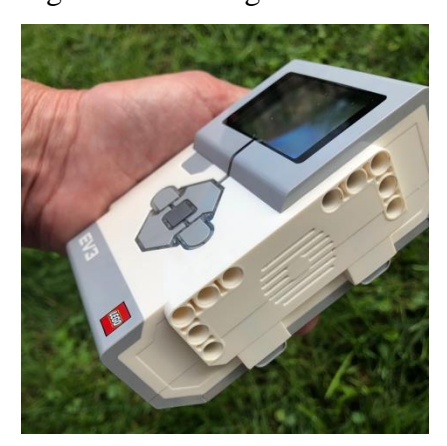
Figure 2: EV3 Lego Robot

Ludi and Reichlmayr (2011) ran a series of workshops for visually impaired young adults using Lego Mindstorms NXT robots. Rather than have students build the robots, they focused on getting students to program them. The apps which Lego makes available for programming its Mindstorms robots use very graphical interfaces, which are not accessible without vision, so Ludi and Reichlmayr set out to find a different software package which would meet the accessibility needs of their project. They selected an open-source programming environment, called BricxCC, which now, in 2020, has not been updated in several years.